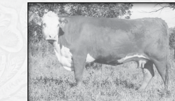
DAM OF LOT 40 • KB L1 DOMINETTE 656