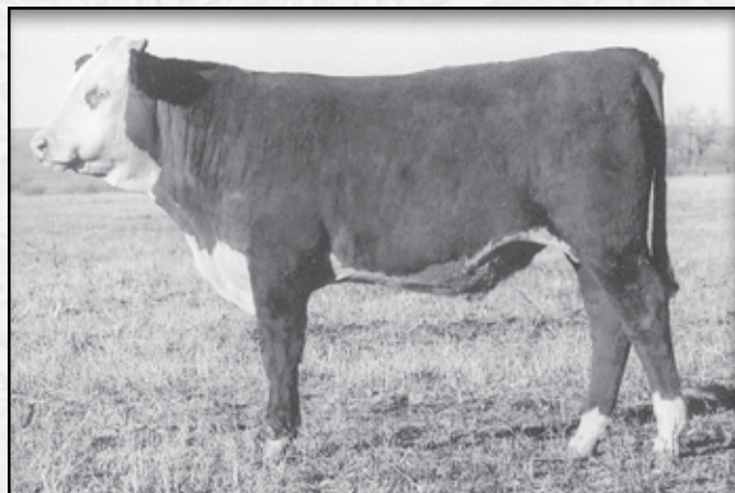
LOT 22 • KB L1 DOMINO 136Y