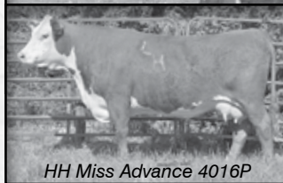
HH Miss Advance 4016P