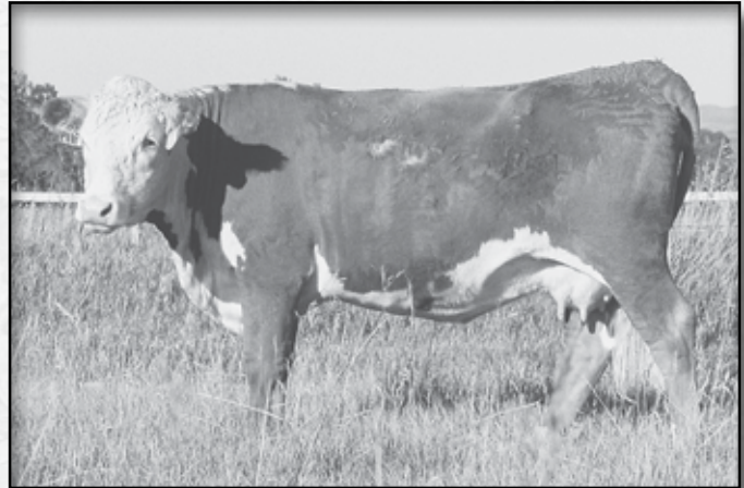
• DAM OF LOT 17 • MONTANA MISS 9114W