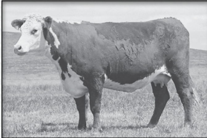
• DAM OF LOT 16 • MONTANA MISS 845U