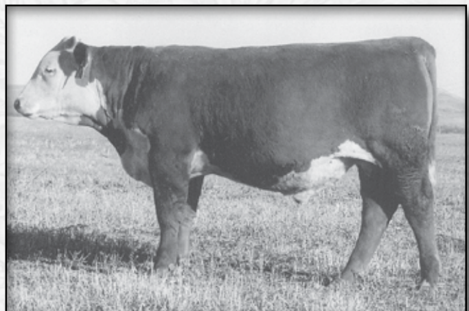
LOT 17 • KB L1 DOMINO 118Y