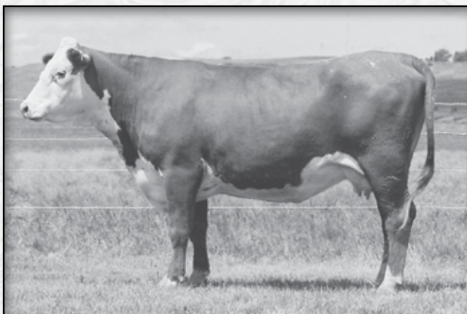
• DAM OF LOT 83 • MONTANA MISS 8130U