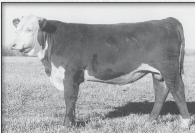
LOT 27 • KB L1 DOMINO 145Y