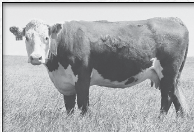
• DAM OF LOT 53 • KB L1 DOMINETTE 744T