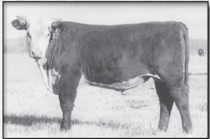
LOT 23 • KB L1 DOMINO 138Y