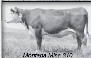
Montana Miss 310