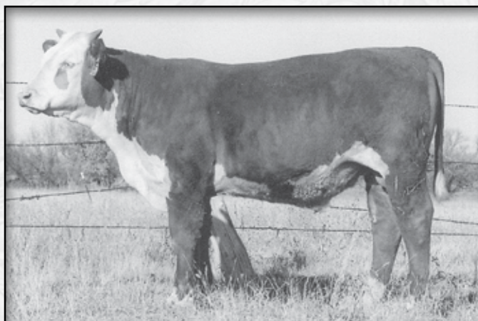
LOT 41 • KB L1 DOMINO 180Y