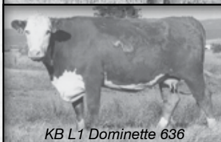
KB L1 Dominette 636