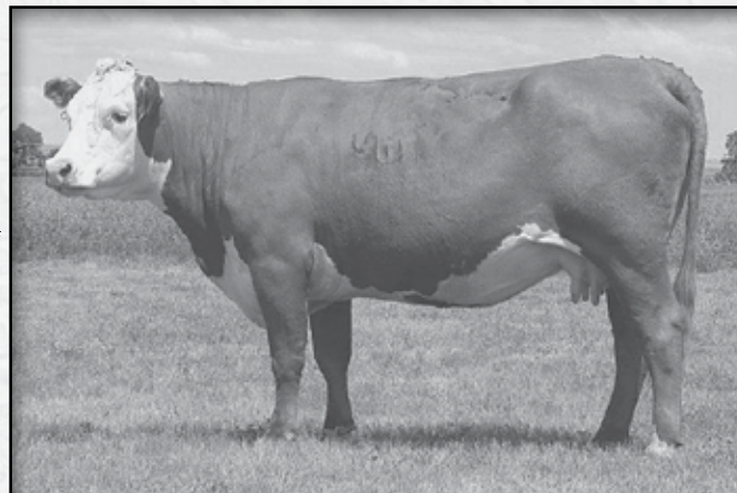
• DAM OF LOT 65 • MONTANA MISS 740T