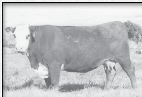
DAM OF LOT 68 • KB L1 DOMINETTE 414P