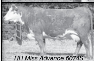
HH Miss Advance 6074S