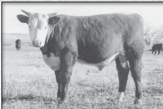
LOT 39 • KB L1 DOMINO 175Y