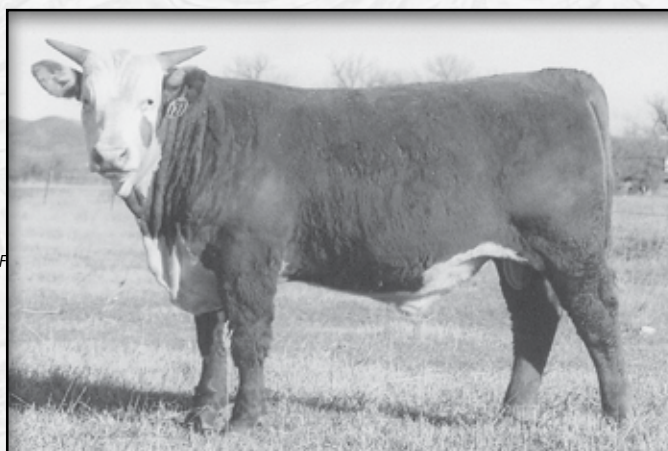
LOT 19 • KB L1 DOMINO 121Y