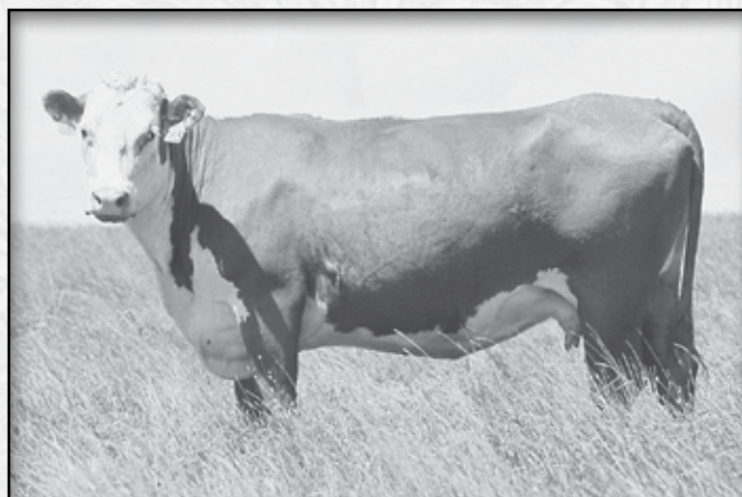
• DAM OF LOT 52 • KB L1 DOMINETTE 765T ET