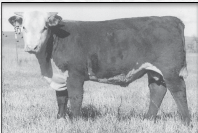
LOT 38 • KB L1 DOMINO 172Y