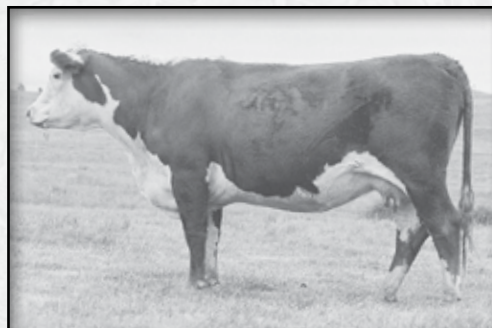
DAM OF LOT 21 • MONTANA MISS 862U