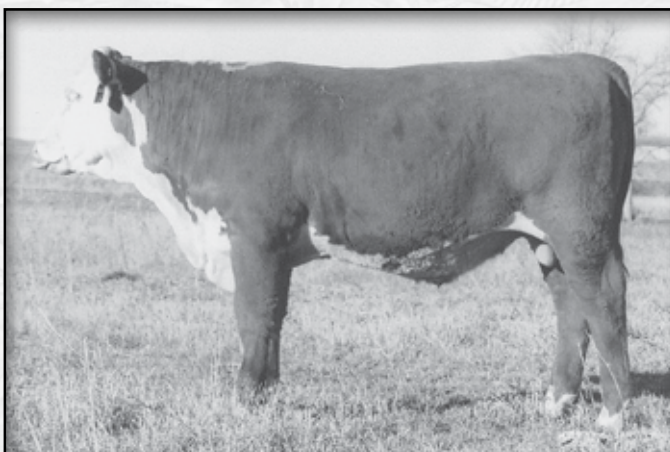
LOT 44 • KB L1 DOMINO 184Y