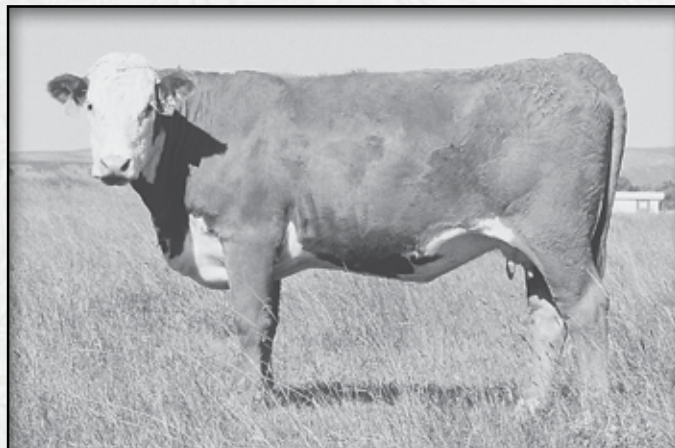
• DAM OF LOT 18 • KB L1 DOMINETTE 9133W