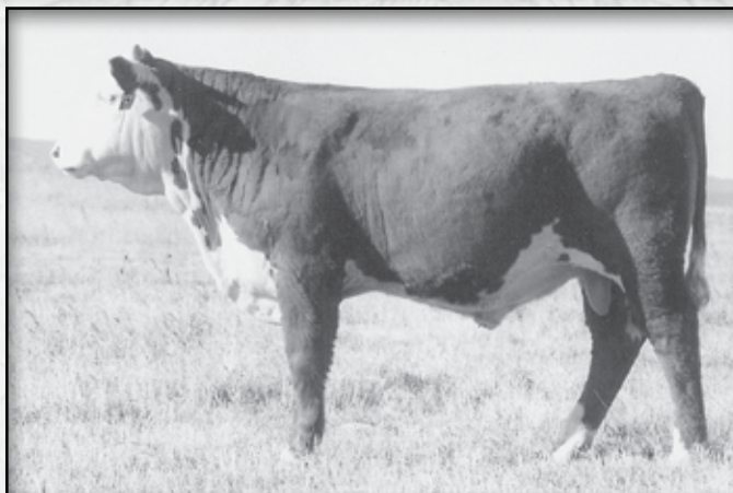
LOT 76 • KB L1 DOMINO 1165Y

Act BW..... 92 9-14 Wt..... 645 Adj. 205.... 680 WDA..... 3.43