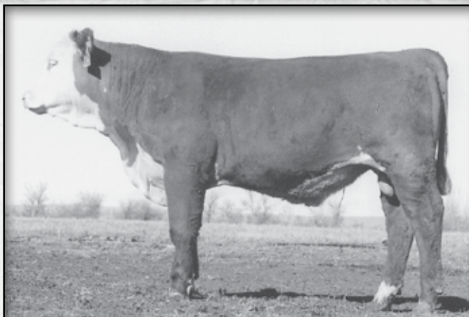
LOT 54 • KB L1 DOMINO 1112Y