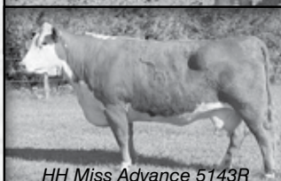
HH Miss Advance 5143R