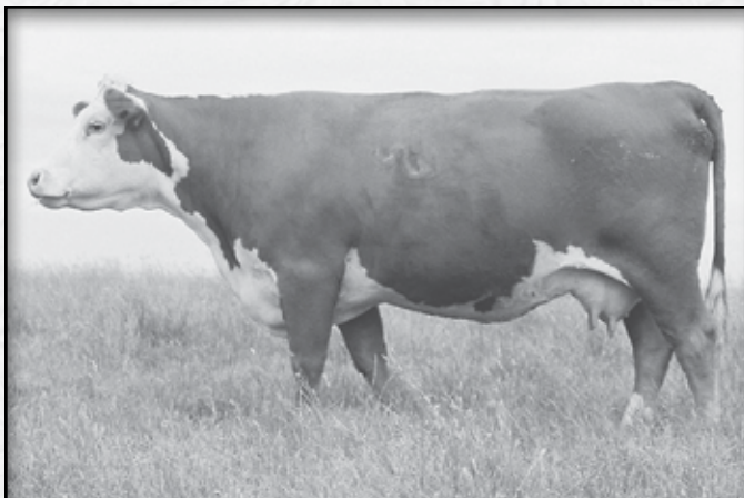
• DAM OF LOT 74 • KB L1 DOMINETTE 415P