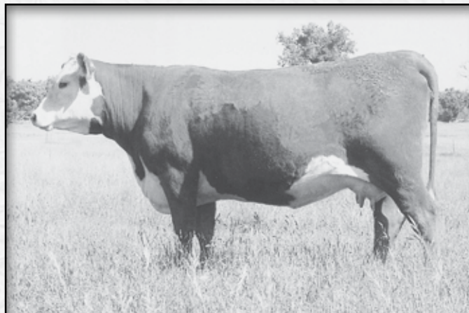
• DAM OF LOT 19 • KB L1 DOMINETTE 945W