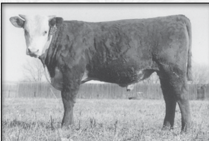
LOT 80 • KB L1 DOMINO 1180Y