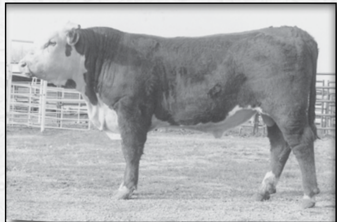
LOT 5 • KB L1 DOMINO 0189X