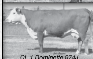
CL 1 Dominette 974J