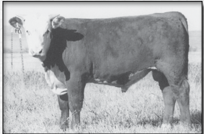
LOT 24 • KB L1 DOMINO 139Y