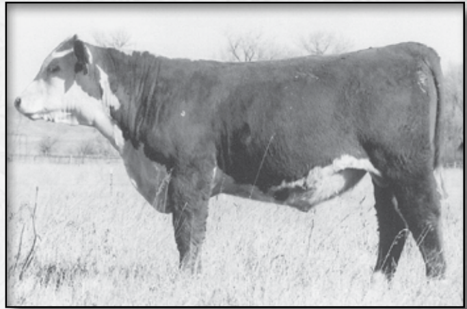
LOT 16 • KB L1 DOMINO 116Y