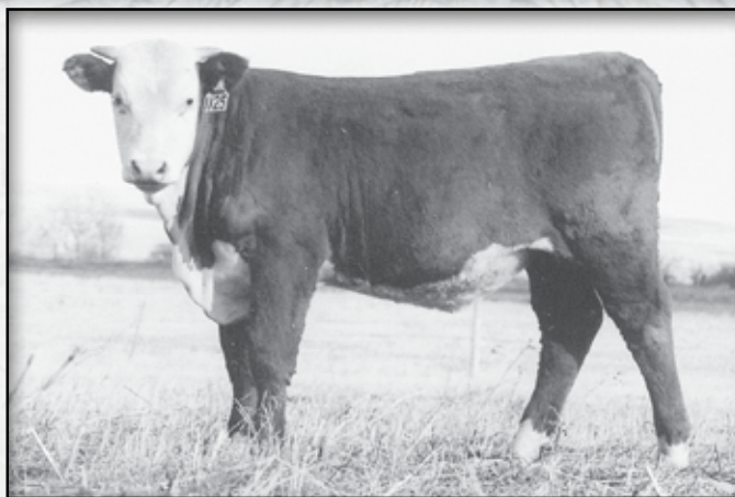
LOT 57 • KB L1 DOMINO 1125Y