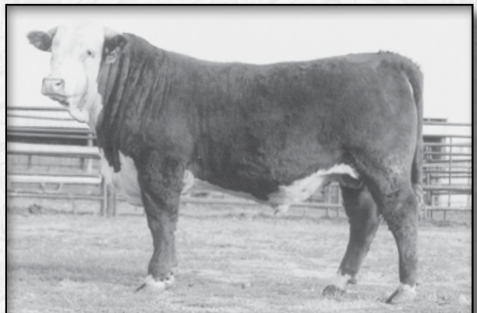
LOT 9 • KB L1 DOMINO 0197X