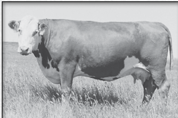
DAM OF LOT 76 • KB L1 DOMINETTE 671

Act BW..... 92 9-14 Wt..... 645 Adj. 205.... 680 WDA..... 3.43