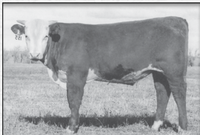
LOT 32 • KB L1 DOMINO 155Y