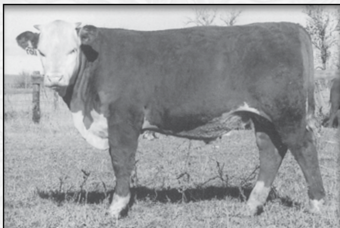
LOT 51 • KB L1 DOMINO 1107Y