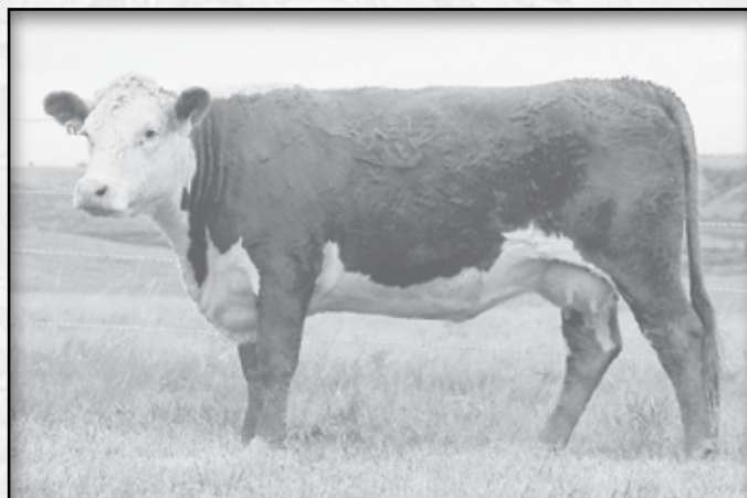
DAM OF LOT 28 • MONTANA MISS 897U