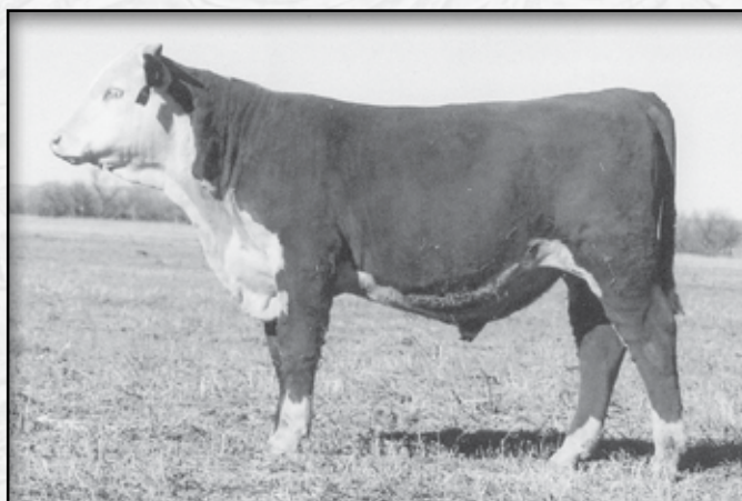
LOT 30 • KB L1 DOMINO 153Y