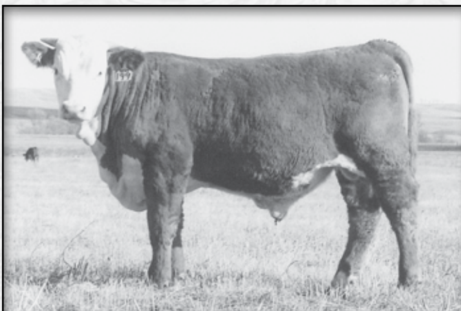
LOT 48 • KB L1 DOMINO 199Y