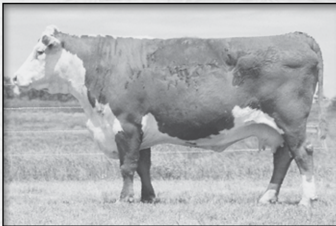
• DAM OF LOT 11 • CL 1 DOMINETTE 2142M 1ET