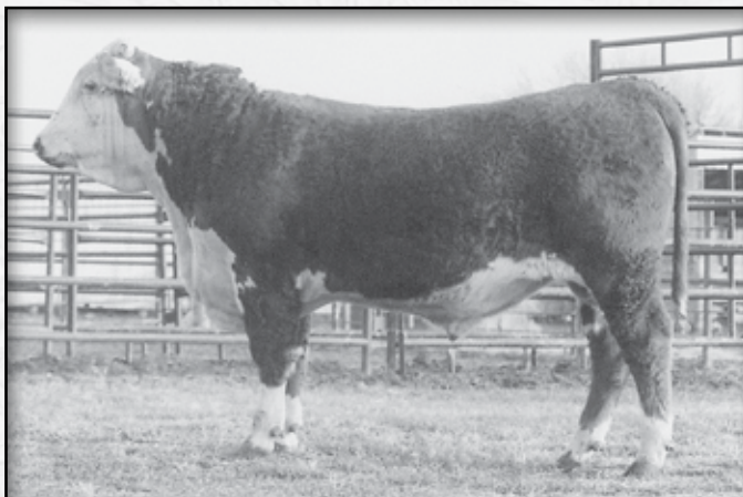
LOT 2 • KB L1 DOMINO 0185X

BW..... 4.6 WW..... 48 YW..... 81 Milk.... 23 M&G... 47 REA.... 15 Marb... .07 CHB.... $24