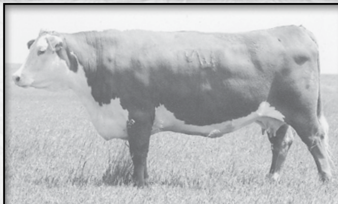
DAM OF LOT 60 • KB L1 DOMINETTE 372