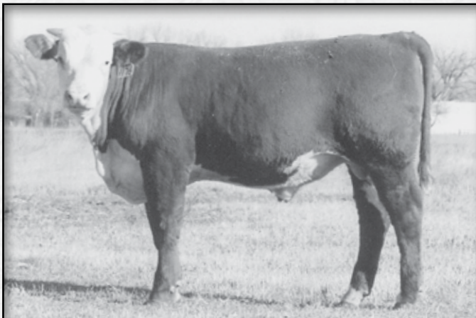
LOT 79 • KB L1 DOMINO 1176Y