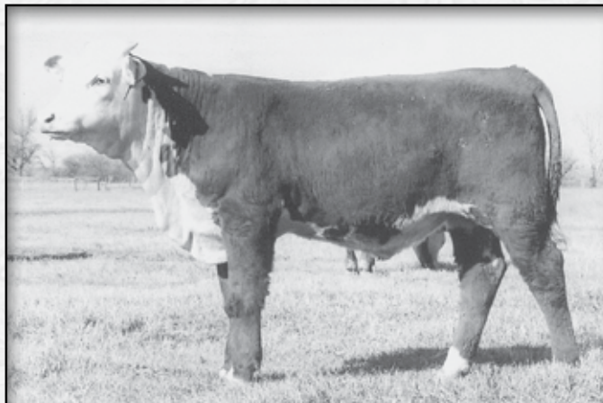
LOT 85 • KB L1 DOMINO 1198Y