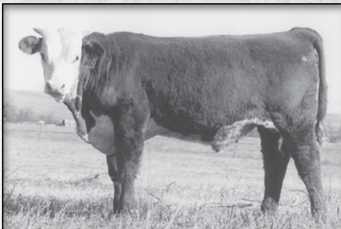
LOT 81 • KB L1 DOMINO 1182Y