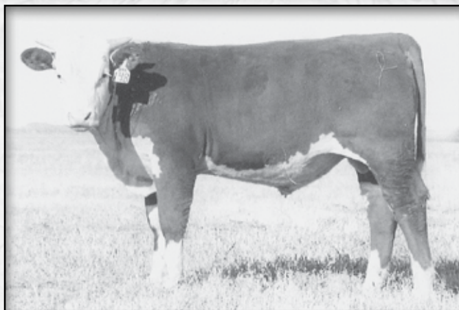
LOT 28 • KB L1 DOMINO 148Y