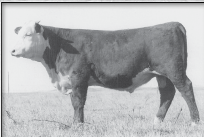
LOT 66 • KB L1 DOMINO 1139Y