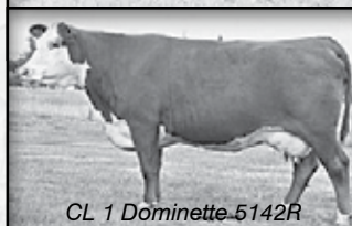
CL 1 Dominette 5142R