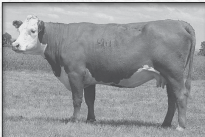
MONTANA MISS 740T DAM OF 922W