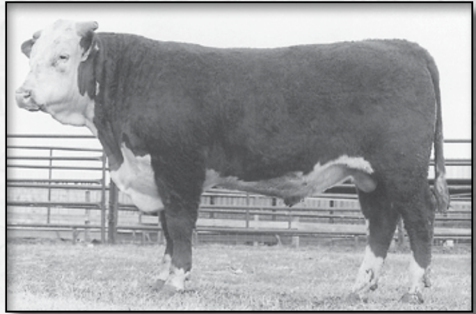
LOT 7 • KB L1 DOMINO 0193X