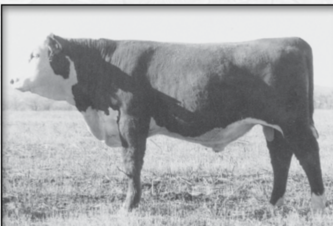
LOT 62 • KB L1 DOMINO 1132Y