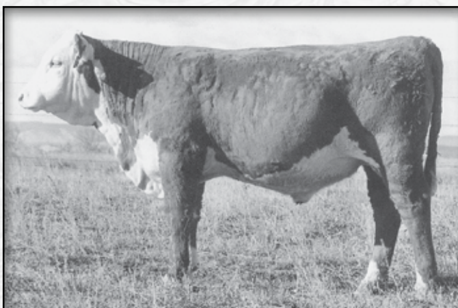
LOT 77 • KB L1 DOMINO 1170Y

Act BW..... 77 9-14 Wt..... 635 Adj. 205.... 670 WDA..... 3.51