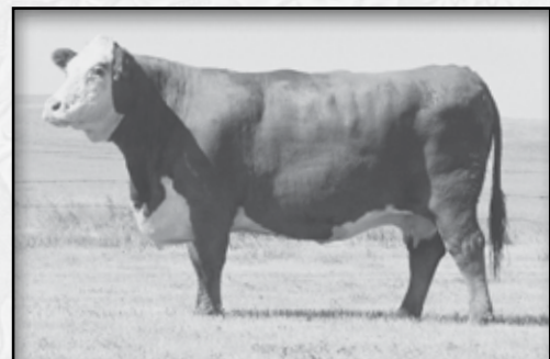
• DAM OF LOT 6 • OXH CRYSTAL 2258