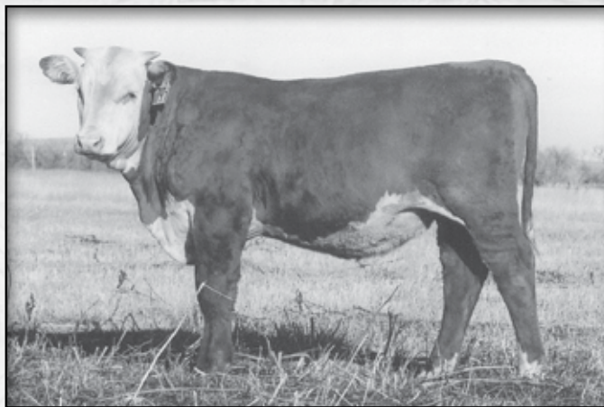
LOT 84 • KB L1 DOMINO 1197Y