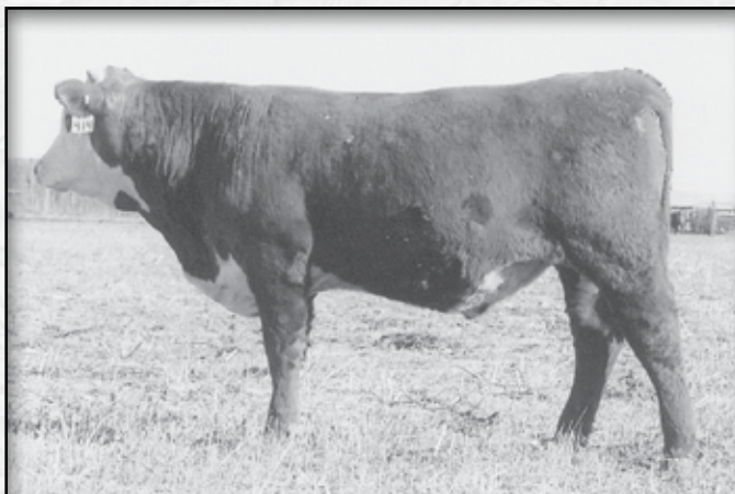
LOT 68 • KB L1 DOMINO 1148Y