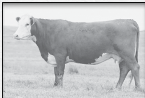
DAM OF LOT 26 • KB L1 DOMINETTE 879U