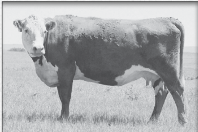
• DAM OF LOT 31 • KB L1 DOMINETTE 772T