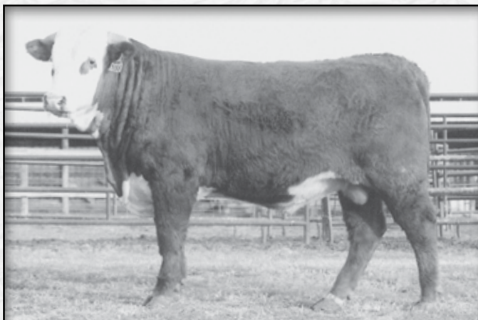
LOT 3 • KB L1 DOMINO 0186X

BW..... 3.3 WW..... 44 YW..... 69 Milk.... 31 M&G... 53 REA.... 02 Marb... .11 CHB.... $21