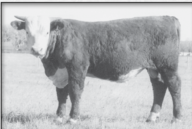
LOT 12 • KB L1 DOMINO 101Y