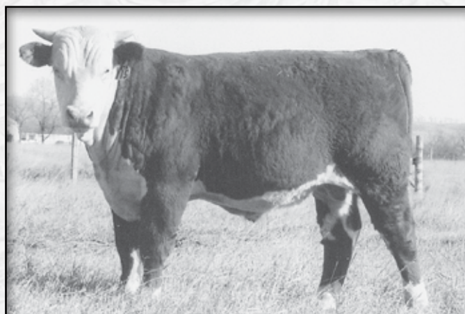
LOT 15 • KB L1 DOMINO 115Y