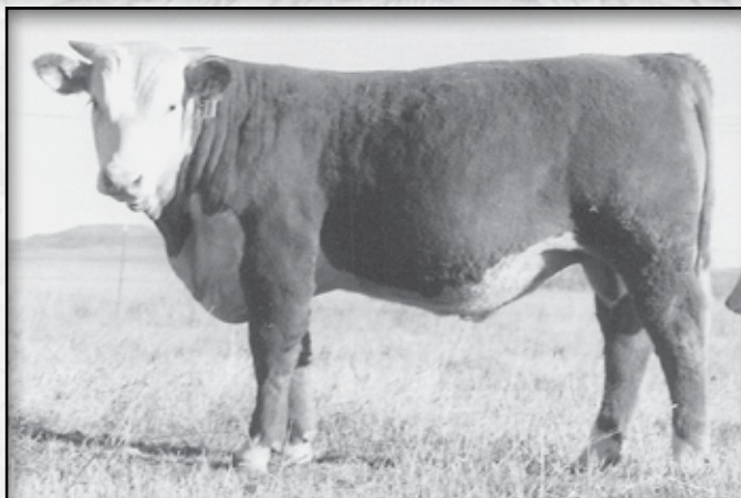
LOT 46 • KB L1 DOMINO 191Y