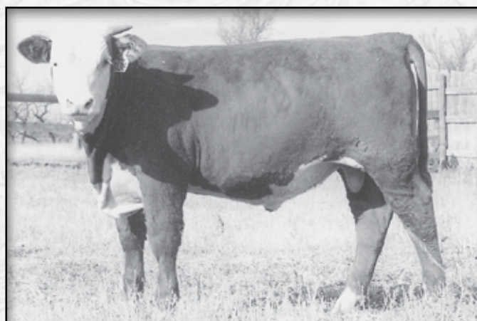
LOT 65 • KB L1 DOMINO 1138Y