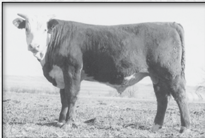
LOT 63 • KB L1 DOMINO 1133Y