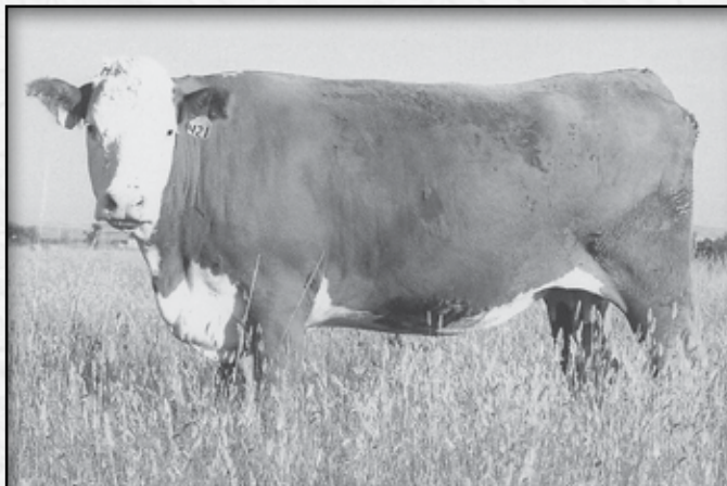
• DAM OF LOT 48 • KB DOMINETTE 421P