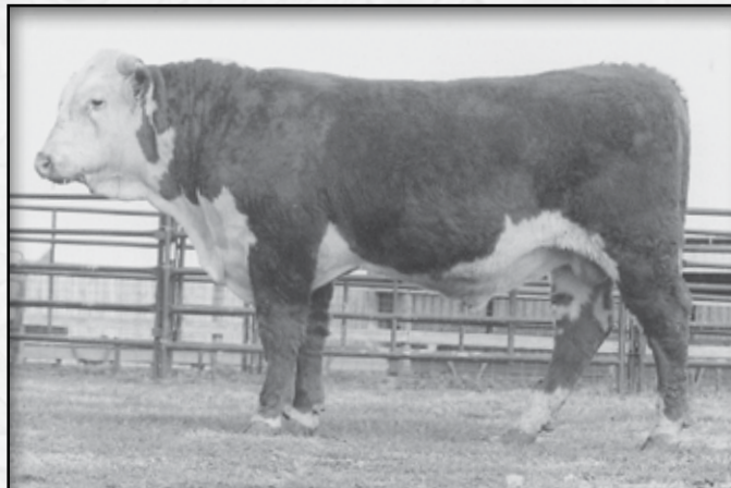
LOT 1 • KB L1 DOMINO 0181X

BW..... 4.4 WW..... 43 YW..... 71 Milk.... 30 M&G... 51 REA.... 27 Marb... -02 CHB.... $19