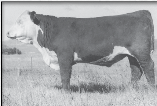
LOT 61 • KB L1 DOMINO 1130Y