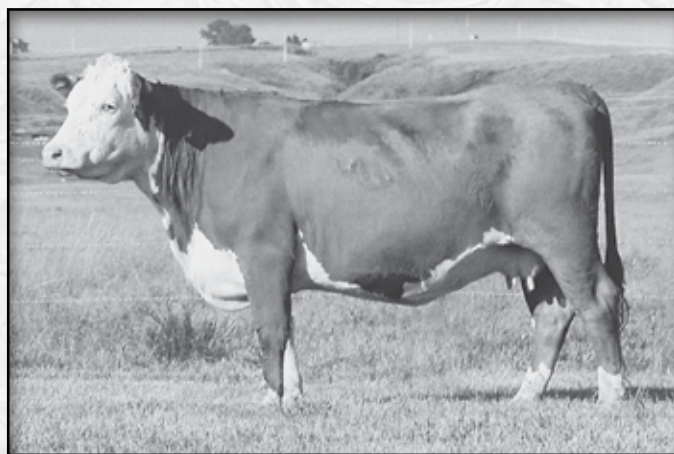
• DAM OF LOT 13 • MONTANA MISS 810U