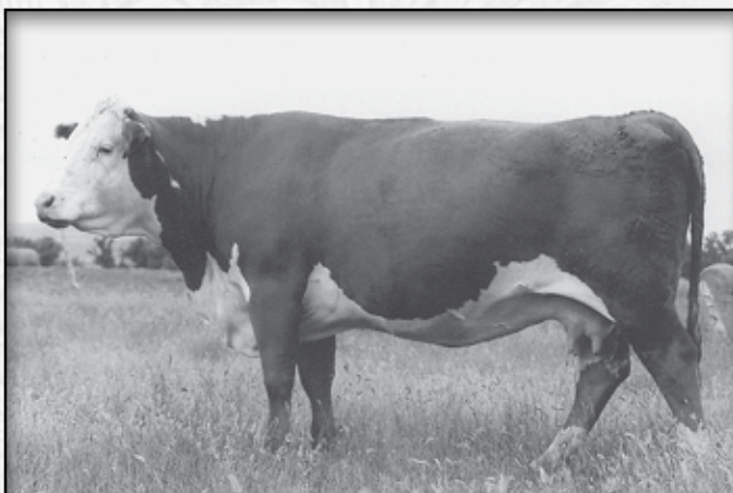
KB DOMINETTE 353N ET DAM OF 844U & 935W