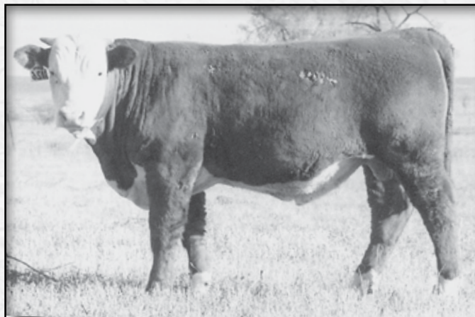
LOT 58 • KB L1 DOMINO 1126Y