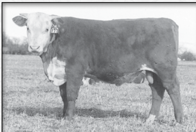
LOT 40 • KB L1 DOMINO 177Y