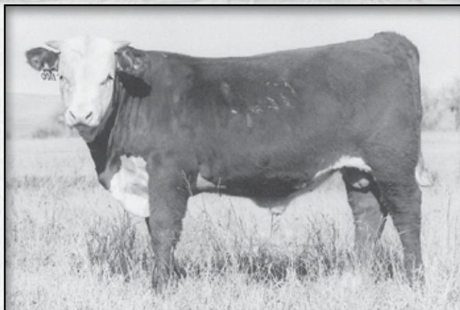
LOT 49 • KB L1 DOMINO 1100Y