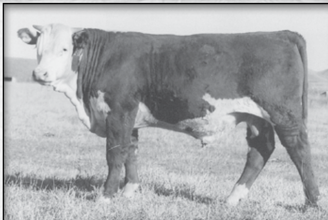
LOT 42 • KB L1 DOMINO 181Y