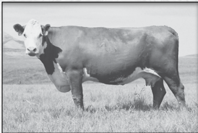
• DAM OF LOT 34 • MONTANA MISS 728T