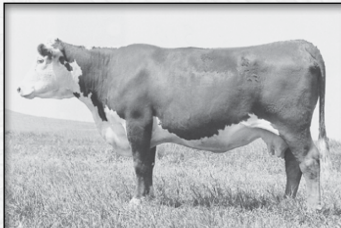
DAM OF LOT 77 • MONTANA MISS 310