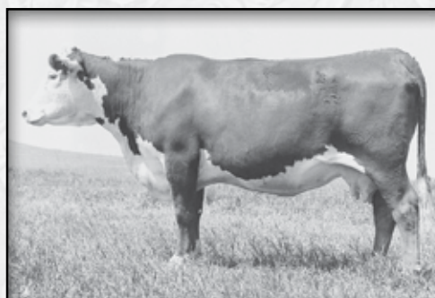
DAM OF LOT 56 • MONTANA MISS 310