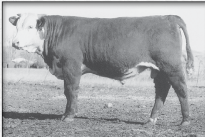
LOT 34 • KB L1 DOMINO 165Y