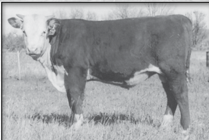
LOT 72 • KB L1 DOMINO 1161Y