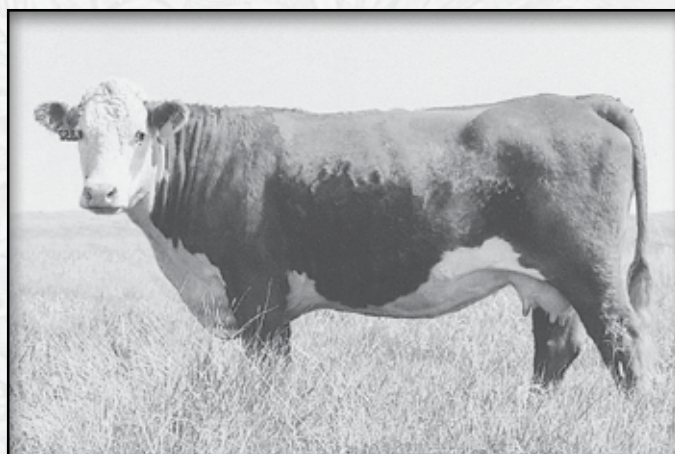
• DAM OF LOT 15 • MONTANA MISS 852U ET