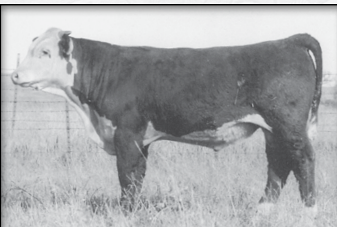
LOT 56 • KB L1 DOMINO 1123Y