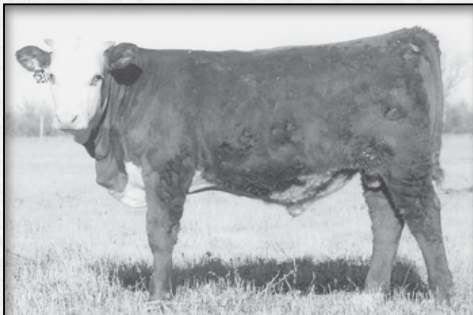
LOT 70 • KB L1 DOMINO 1152Y