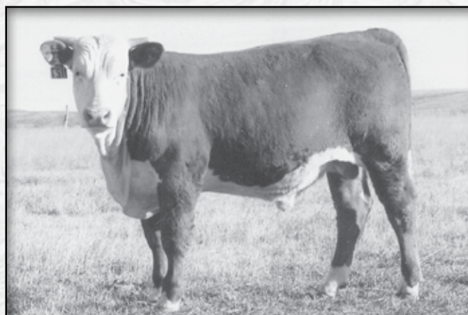
LOT 59 • KB L1 DOMINO 1127Y