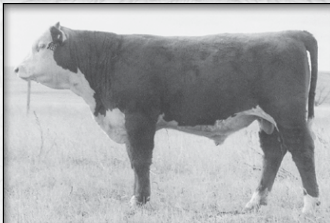
LOT 18 • KB L1 DOMINETTE 120Y