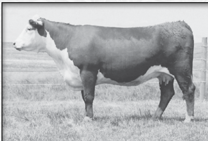
DAM OF LOT 30 • MONTANA MISS 8102U