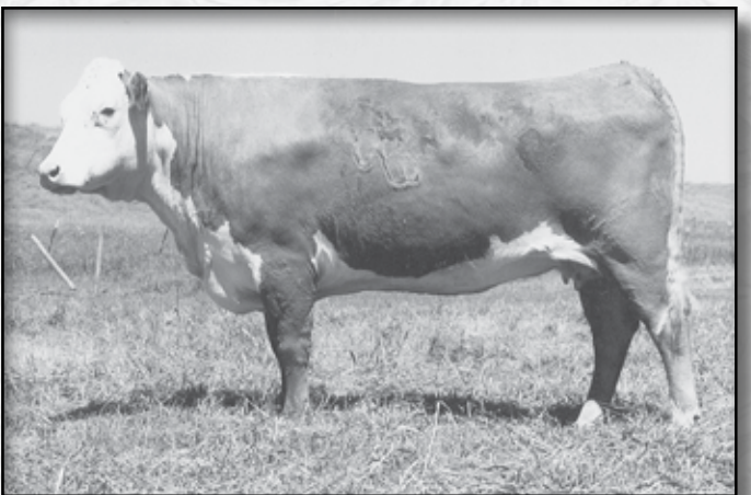
• GRANDAM OF LOT 25 • MONTANA MISS J336