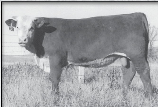
LOT 52 • KB L1 DOMINO 1109Y