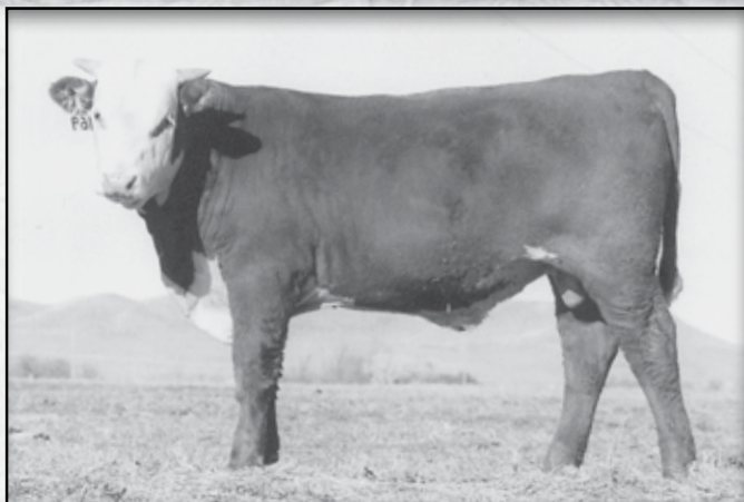
LOT 36 • KB L1 DOMINO 169Y