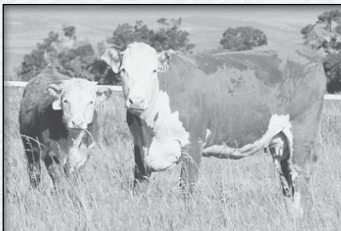
• DAM OF LOT 35 • MONTANA MISS 953W