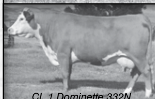
CL 1 Dominette 332N