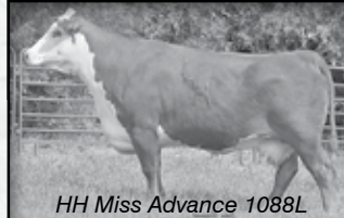
HH Miss Advance 1088L