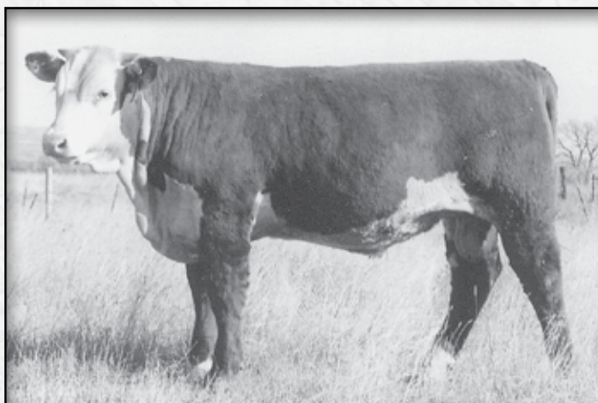
LOT 29 • KB L1 DOMINO 150Y