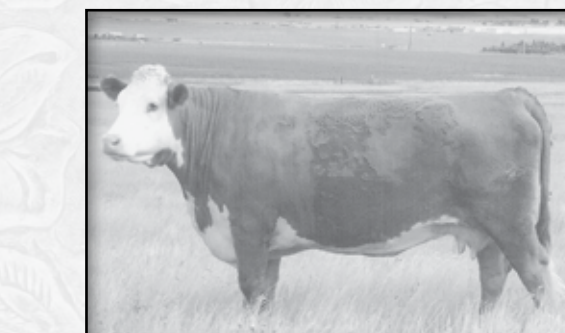
DAM OF LOT 50 • JBN 0072 DOMINETTE 305