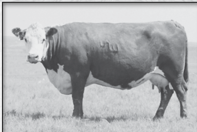
• DAM OF LOT 71 • MONTANA MISS 524R