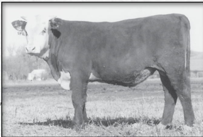
LOT 67 • KB L1 DOMINO 1141Y