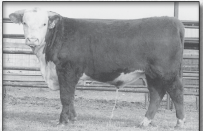
LOT 6 • KB L1 DOMINO 0192X