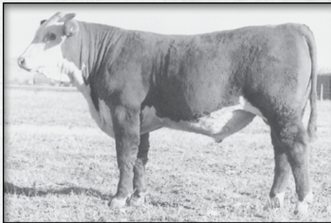
LOT 20 • KB L1 DOMINO 126Y