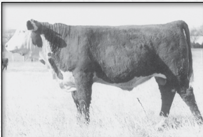
LOT 55 • KB L1 DOMINO 1119Y