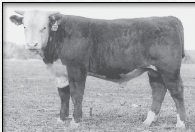
LOT 14 • KB L1 DOMINO 114Y