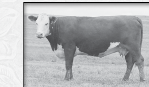
DAM OF LOT 37 • KB L1 DOMINETTE 824U