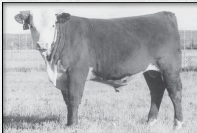
LOT 13 • KB L1 DOMINO 103Y