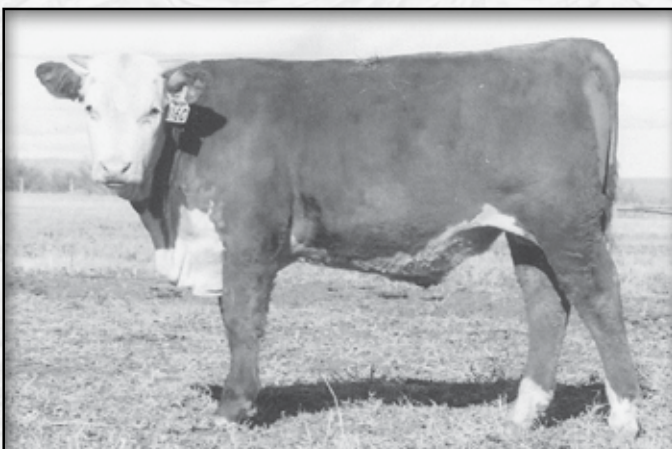
LOT 71 • KB L1 DOMINO 1160Y ET