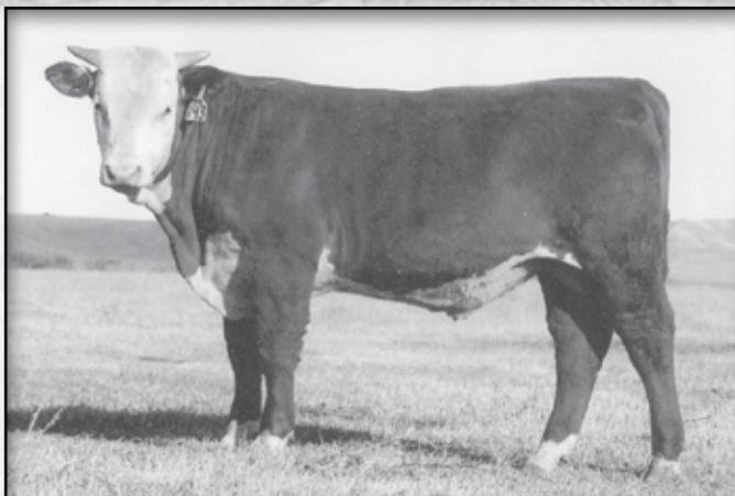
LOT 26 • KB L1 DOMINO 143Y