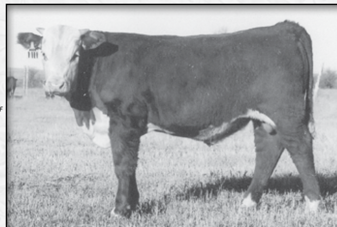
LOT 53 • KB L1 DOMINO 1111Y