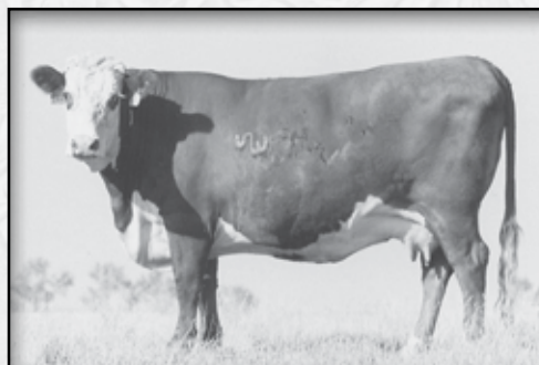
DAM OF LOT 62 • JA L1 DOMINETTE 0220