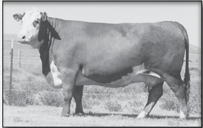
• DAM OF LOT 3 • MONTANA MISS 389