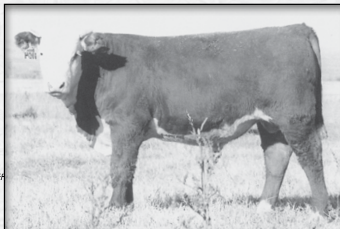
LOT 50 • KB L1 DOMINO 1104Y