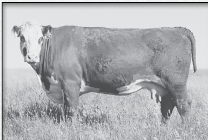
• DAM OF LOT 81 • MONTANA MISS 762U