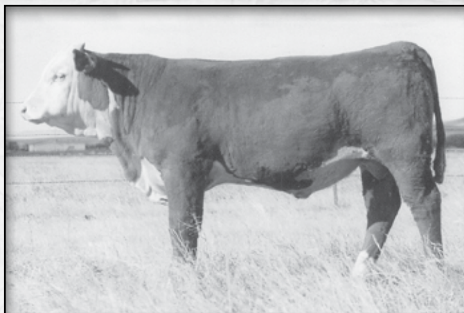
LOT 31 • KB L1 DOMINO 154Y