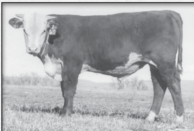
LOT 37 • KB L1 DOMINO 171Y