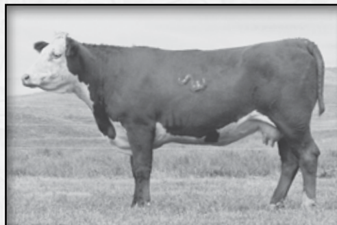
DAM OF LOT 20 • MONTANA MISS 865U