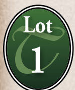
Lot 1 — CT Outcross 78X