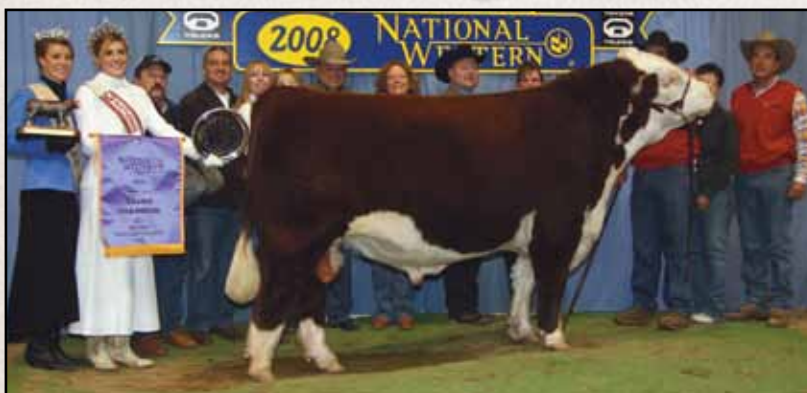
H Easy Deal 609 ET — Sire of Lots 12 and 13. Denver 2008 National Champion Bull.