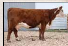
C&L Junior Miss 434V 13P — Dam of Lot 26