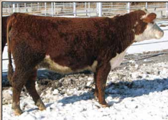
Lot 45 — CT Miss Premier 146U