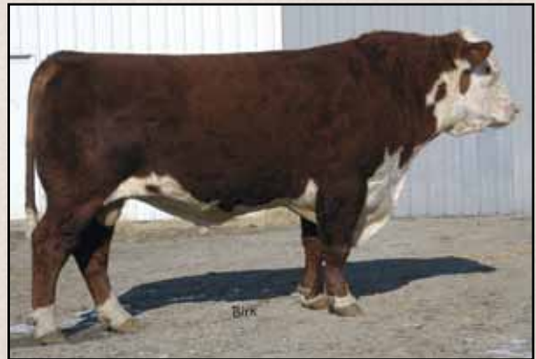
Lot C — GHC PREMIER 155K