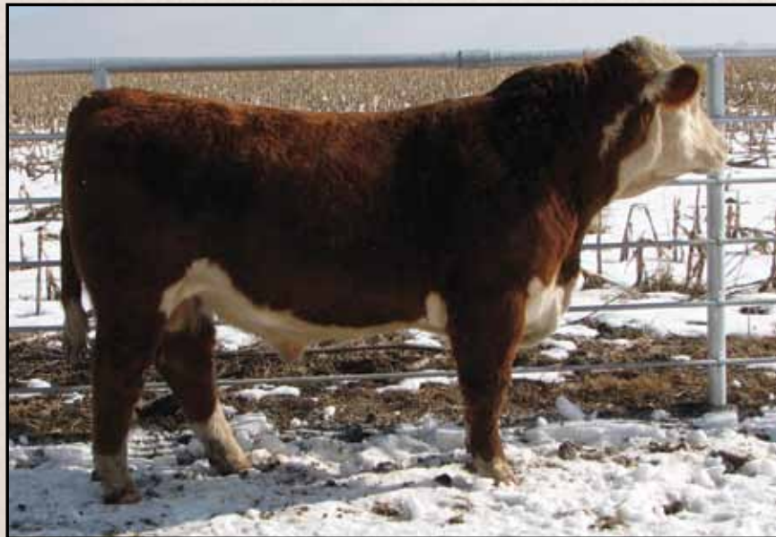
Lot 31 — CT Hunter 99W