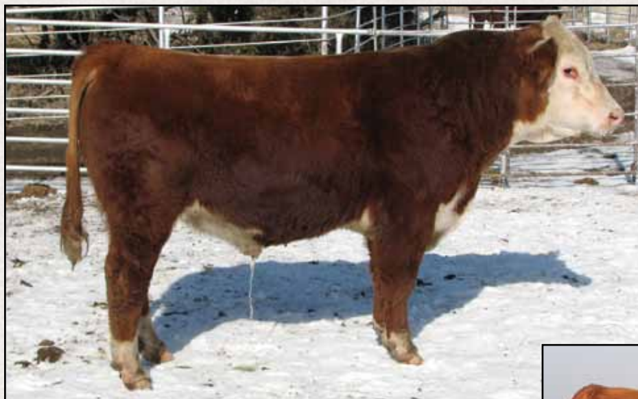
Lot 18 — CT Ribeye 19W

The coming 2-year-old bulls were fed a light growing ration from weaning to yearling time. They were on pasture this past summer until December 5th then have been on a corn silage/grain ration this winter.