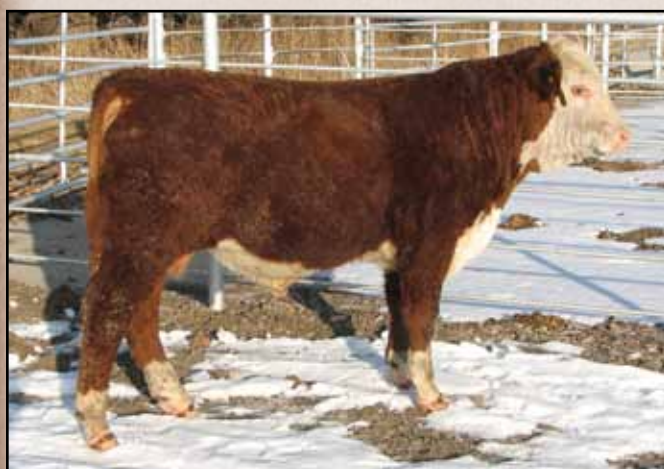
Lot 6 — CT Carrington 80X

Cardinal is super stout and has a great muscle pattern to him. His mother is a great cow in the Crittenden Bros. herd in Saskatchewan. A Canadian Agribition class winner.