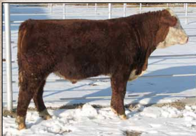
Lot 5 — CT Cardinal 65X