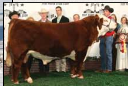
Golden Oak Outcross 18U — Sire of Lot 1. Many-times show champion and sire of top selling bulls and females.