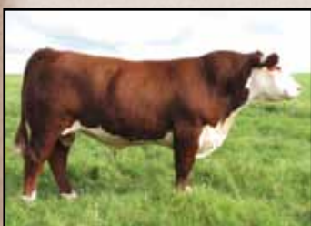
AH JDH Cracker Jack 26U ET — Sire of Lot 41