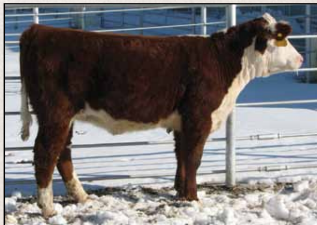
Lot 32 — CT Miss Outcross 112X