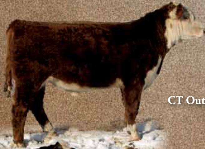
CT Outcross 78X