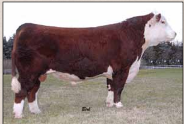
Lot D — CT BOOKER 161T ET