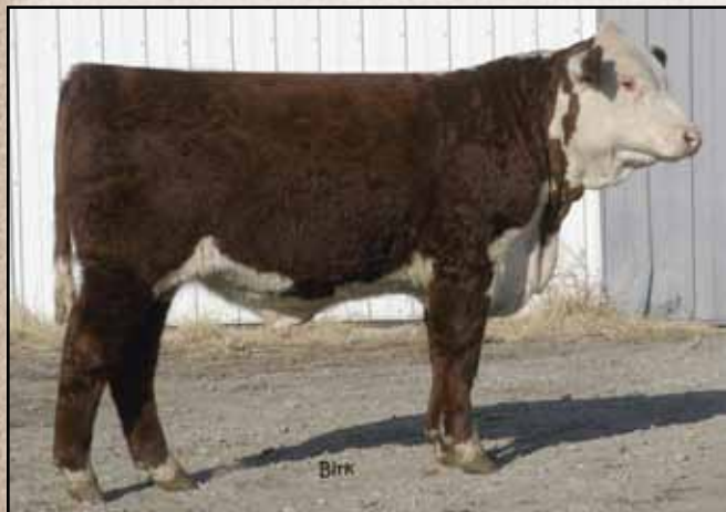
CT GHC Peacemaker 123R — Pictured as a calf Sire of Lots 55 and 56