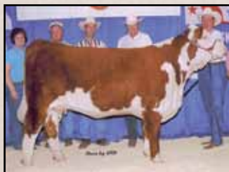
CT Miss Lassie 181M — Dam of Lot 41 2004 Nebraska State Fair Female and Reserve Supreme Champion Heifer