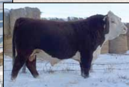
McCoy 55M Absolute 49S — Sire of Lot 2. Service sire on the bred heifers selling.