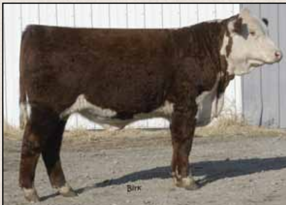
CT CHC Peacemaker 123R