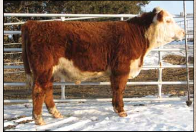
Lot 3 — CT Bailout 44X