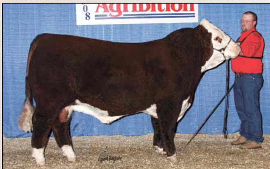
GHC Cardinal 57T — Sire of Lots 5 and 6.

Cardinal is super stout and has a great muscle pattern to him. His mother is a great cow in the Crittenden Bros. herd in Saskatchewan. A Canadian Agribition class winner.