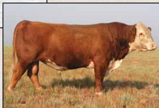
SHF Rib Eye M326 R117 — Sire of Lot 18