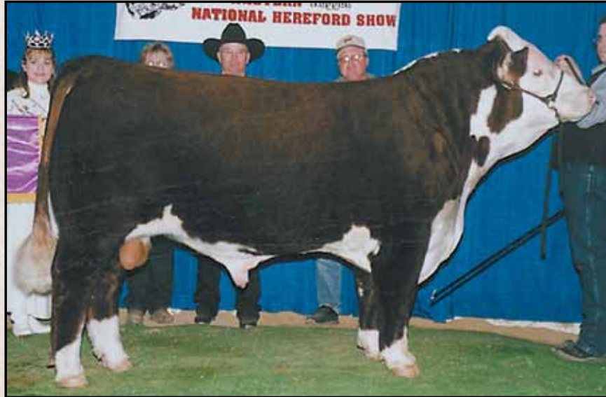
CT Farmer 114L — Sire of Lot 30