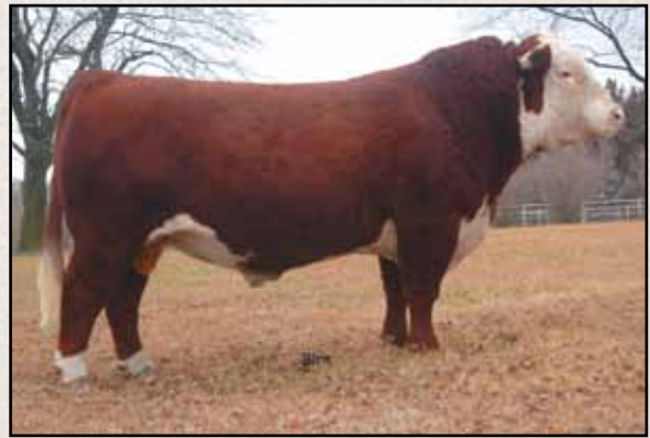
Lot A — NJW FHF 9710 TANK 45P