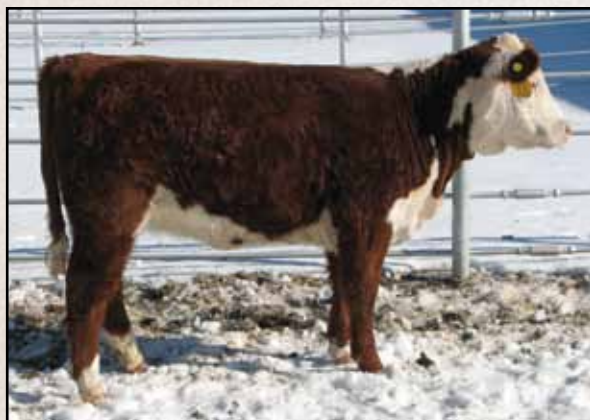
Lot 37 — CT Miss Tango 93X ET