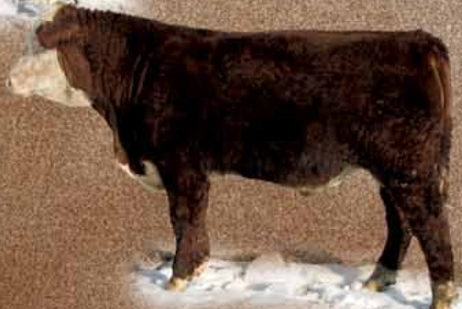
CT Cardinal 65X