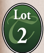
Lot 2 — CT Absolute 96X