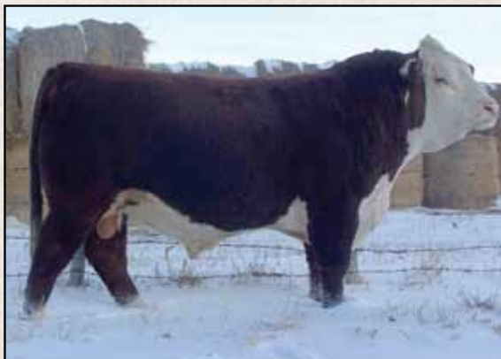
McCoy 55M Absolute 49S