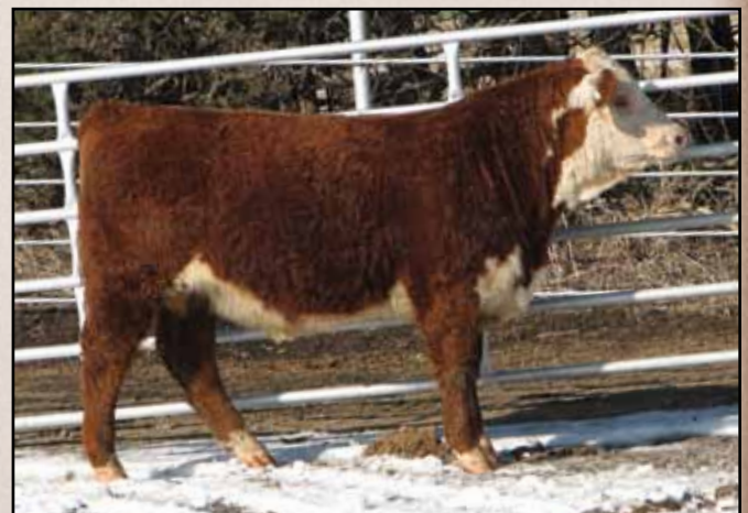
Lot 4 — CT Bailout 147X