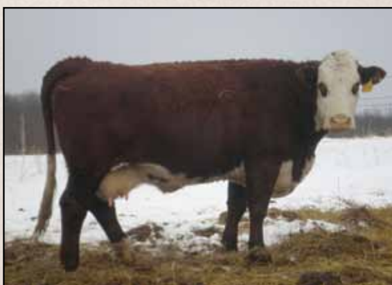
CT Miss Bond 9864 — Dam of Lot 13 and 42