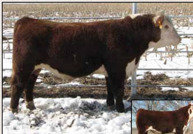
Lot 26 — CT Folkman 112W