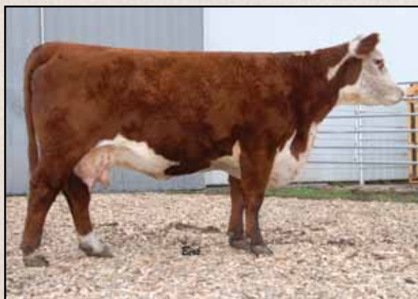
C&L Junior Miss 434V 13P — Dam of Lot 38