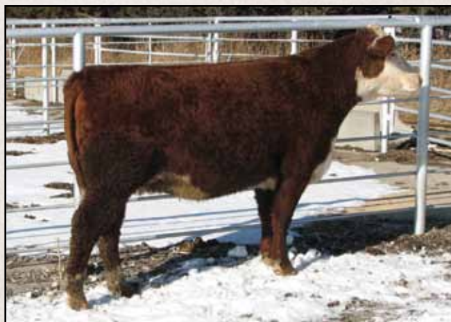
Lot 50 — CT Miss Tank 130U