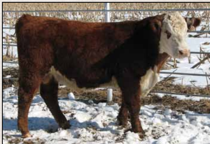
Lot 7 — CT Energy 123W

P43118090 — Calved: Sept. 24, 2009 — Tattoo: BE 123W TRM 37E 121 KING 3238 RRO TRM CLEAN GENES 6201 P4270347 TRM 2250 SPENDOR P606 4189 TRM 37E 121 KING 3238 TRM 4140 QUEEN 6091 P4270347 TRM 6104 MARISSA 4140 ET KPH PHASE 121 (SOD,CHB) GERBER BG1 CHROMAID 37E (DOD) PW VICTOR BOOMER P606 (SOD)|(DLE|IEF) RRO TRM VIVIAN 2250 (DOD) KPH PHASE 121 (SOD,CHB) GERBER BG1 CHROMAID 37E (DOD) SHF MARSHAL 236G M33 (SOD,CHB) TRM 334 4031 6104