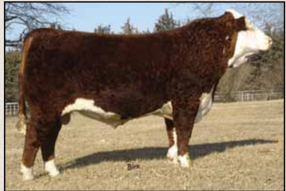
Lot B — HH HUNTER 572P