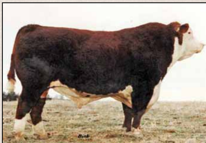
Walpole Cheque 2R — Sire of Lot 28