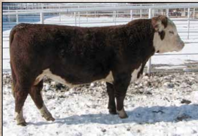
Lot 21 — CT Tiger 87W