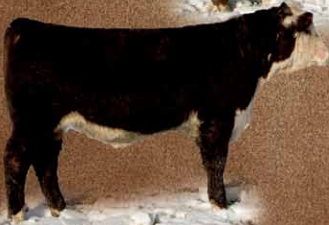
CT Absolute 96X