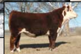
SB STAR Hollywood 103N ET — Sire of Lots 25 and 26