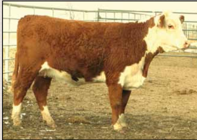
Lot 43 — CT Miss Tango 73X ET