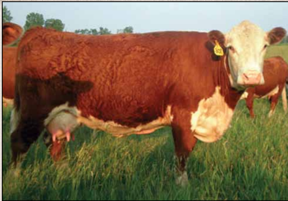
CT Miss Alpha 706 — Dam of Lot 24