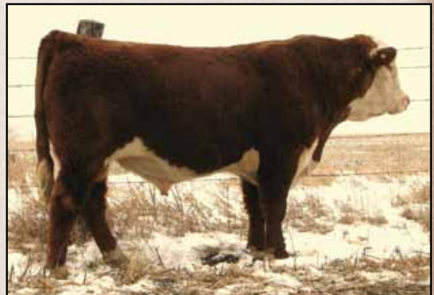
Lot 30 — CT Absolute 64X