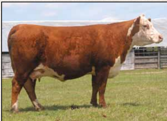
JWR Lady Boomer 481N — Dam of Lot 21