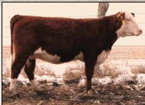
Lot 47 — CT Miss Cardinal 122X

P43139356 — Calved: March 12, 2010 — Tattoo: BE 122X GHC CANUCK 12R P43101777 HAROLDSON'S CHERYL 40J 96M GHC STAR MOOSE 59M (CHB) HAROLDSON'S L7 DEANNE 15E 40G HAROLDSON'S JUSTICE 20X 40J MICGIL'S BELINDA 22 9F GHC LAWMAN 108H (SOD)(DLF,HYF,IEF) CT MISS KRIS 60L P42221588 CT MISS FORTUNE 9549 GHC CRUTCH 58F GHC MS NANCY RENEE 48A WTK 119A FORTUNE 73C (SOD) MISS MAJESTAS 9064