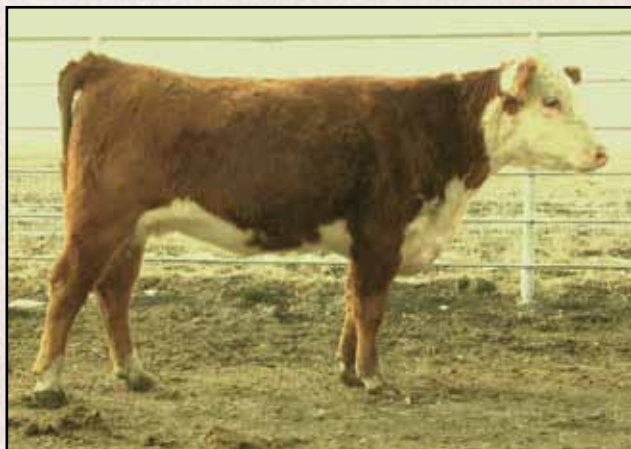
Lot 39 — CT Miss John Wayne 69X