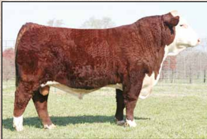
THM Sleep Easy 3060 — Sire of Lots 15 and 16