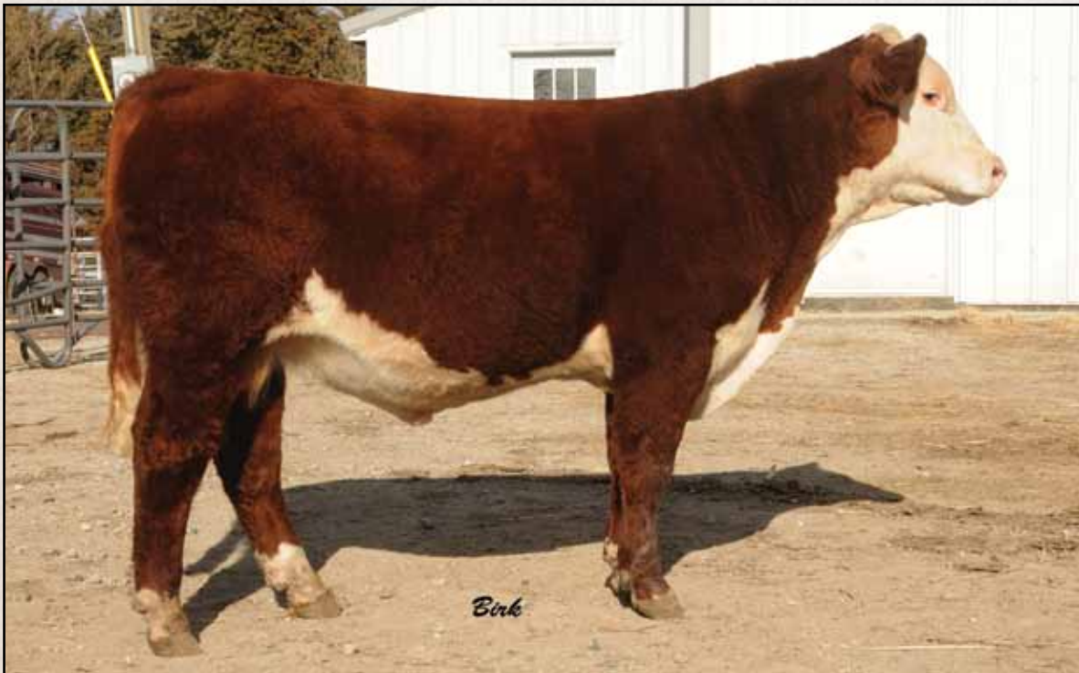
Lot 1 — CT Raven 01Y

Carcass ultrasound information will be available sale day.