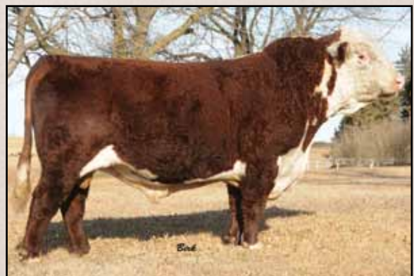
Ref. Sire D — CT GHC Peacemaker 123R

• Top selling bull in our 2006 sale. • A tremendous calving ease bull that sires growth and performance. • Service sire on the bred heifers selling. • Owned with Oltmans Polled Herefords.