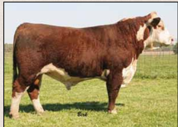
RHF 4037 New Generation 8111U ET — Brother of Lot 21