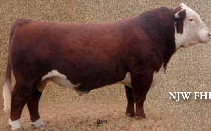
NJW FHF 9710 Tank 45P