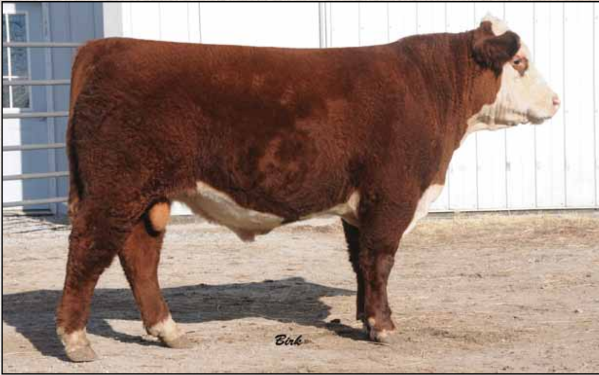
Lot 8 — CT Industry 170X ET