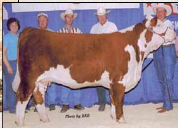
CT Miss Lassie 181M — Sister to Lot 17