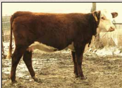
Lot 51 — CT Miss Cardinal 116X

P43139349 — Calved: March 30, 2010 — Tattoo: BE 116X GHC CANUCK 12R P43101777 HAROLDSON'S CHERYL 40J 96M GHC STAR MOOSE 59M (CHB) HAROLDSON'S L7 DEANNE 15E 40G HAROLDSON'S JUSTICE 20X 40J MICGIL'S BELINDA 22 9F CT FARMER 114L (CHB) CT MISS FARMER 153N P42451927 PDM LOGANETTE 5087 GHC LAWMAN 108H (SOD)(DLF,HYF,IEF) CT MISS BOOMER 9621 BAR JZ TRADITION 434V (SOD)(DLF,HYF,IEF) PDM LOGANETTE 3013