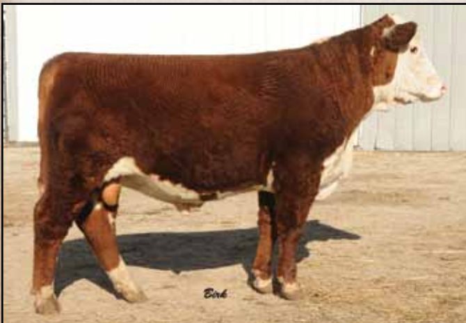
Lot 13 — CT Tank 172X