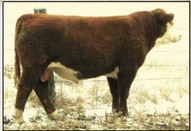
Lot 28 — CT Cardinal 120X