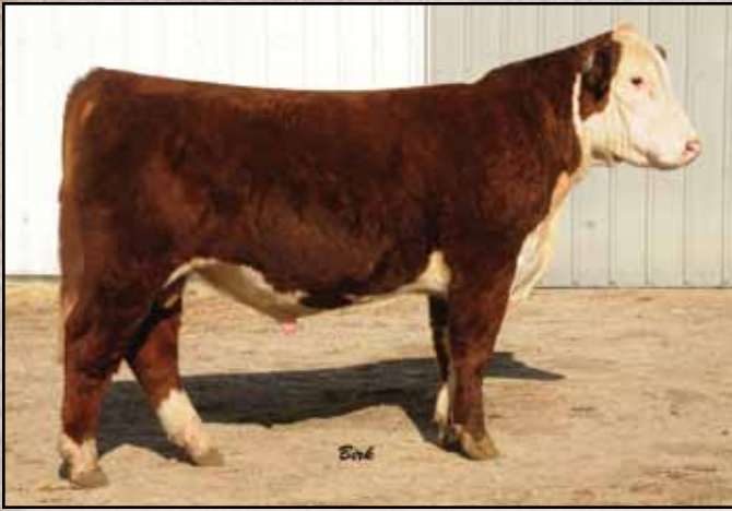
Lot 11 — CT Trojan 169X ET