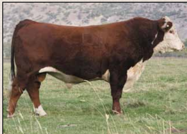
KT John Wayne 7167 — Sire of Lot 39