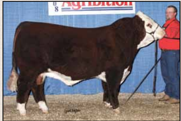
Ref. Sire B — GHC Cardinal 57T

• Cardinal has exceeded our expectations. He has all the bells and whistles as he sires pigment, growth and calving ease. We've calved a few daughters and they have good, level udders and milk flow. The carcass data looks good also.