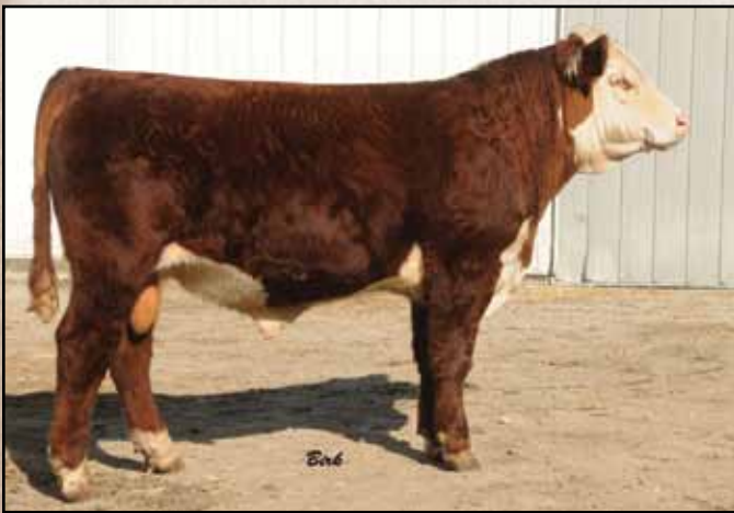
Lot 12 — CT Tank 157X