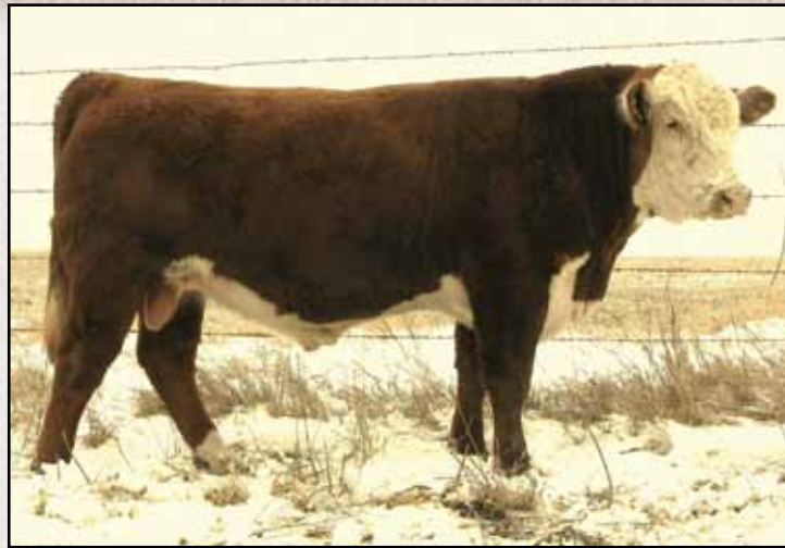
Lot 21 — CT Target 139X