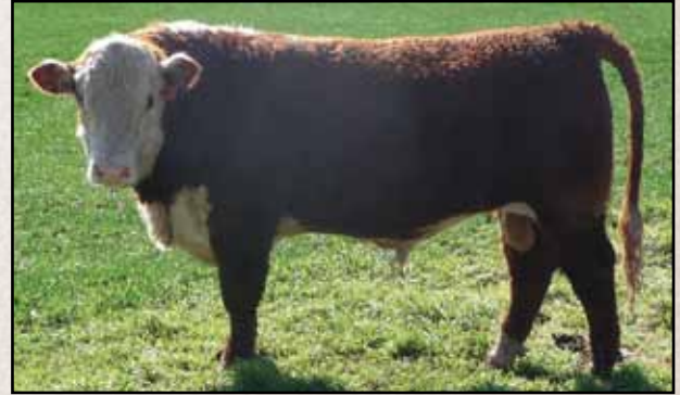
LOEWEN 502R 28R 66X

KCF BENNETT 3008 M326 (CHB)(DLF,HYF,IEF) RRH MR FELT 3008 (SOD,CHB)(DLF,HYF,IEF) HVH MISS M326 28R (DLF,HYF,IEF) KCF MISS 459 F284 P42576683 HVH MISS MOM C54 97M ET /S MISTER MOM 7745 (SOD)(DLF,IEF) RU 20X SUSAN 54C