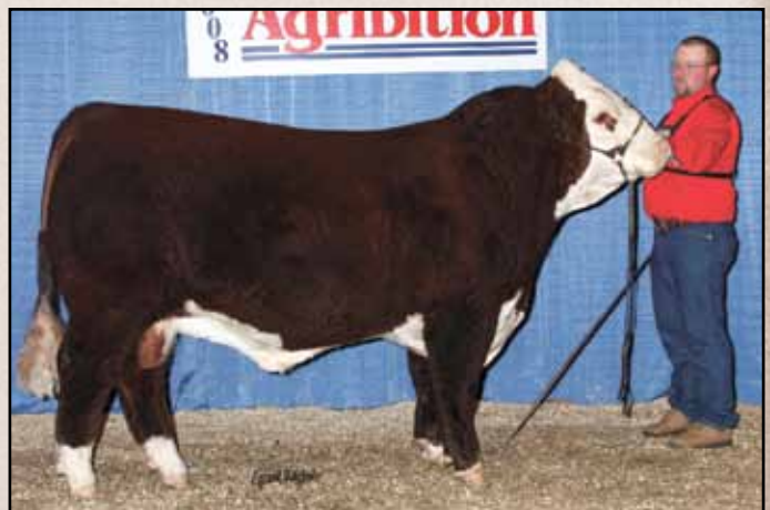
GHC Cardinal 57T — Sire of Lot 1