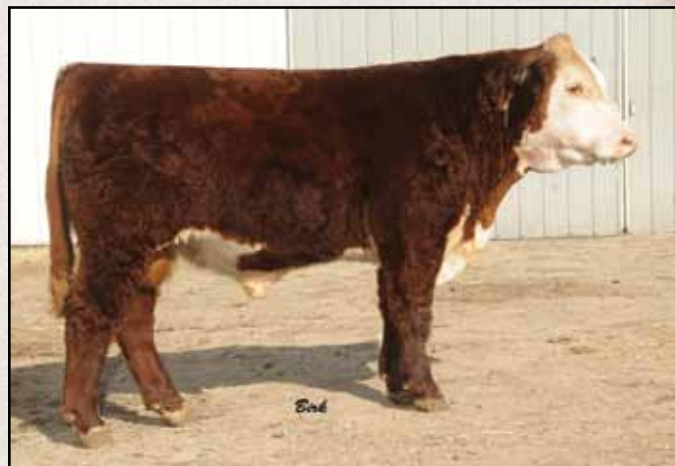
Lot 2 — CT Redman 30Y