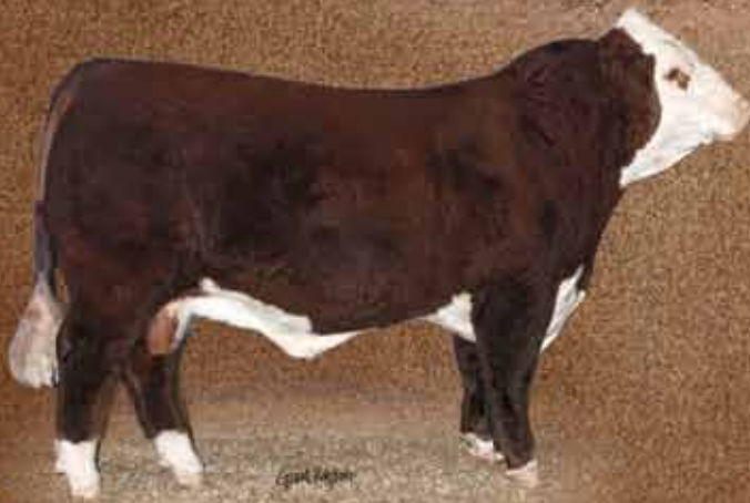
GHC Cardinal 57T