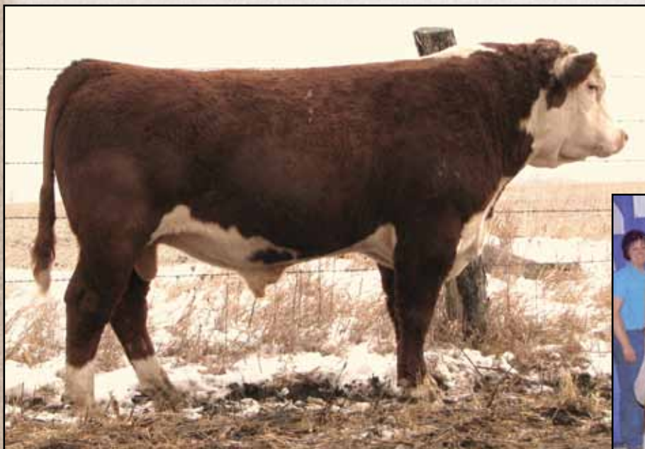
Lot 17 — CT Trademark 102X ET

The 2-year-old bulls were raised on grass with no grain. They were brought in December 5th and have been fed a high roughage ration.