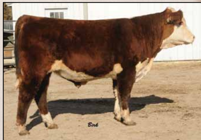
Lot 4 — C&L CT Constellation 58G 16Y