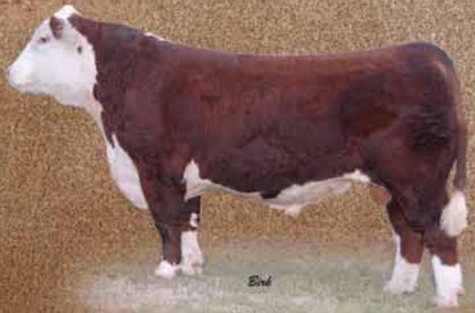
CT Booker 161T ET