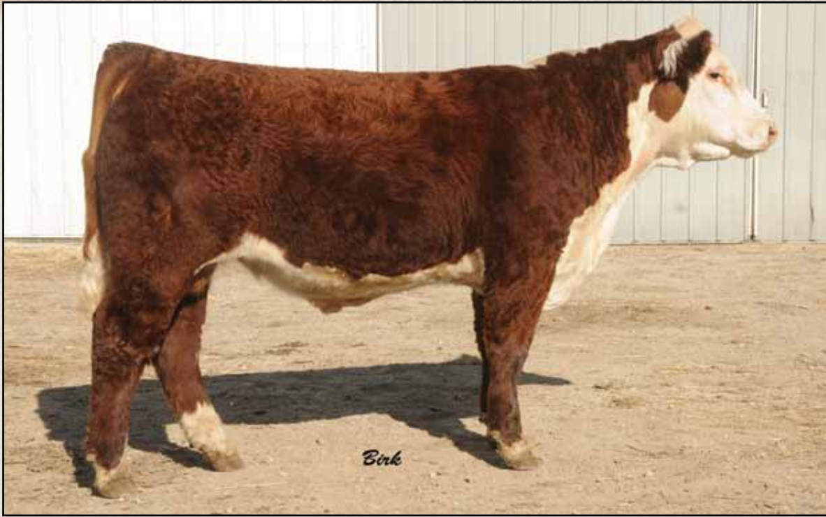
Lot 5 — CT Benchmark 08Y