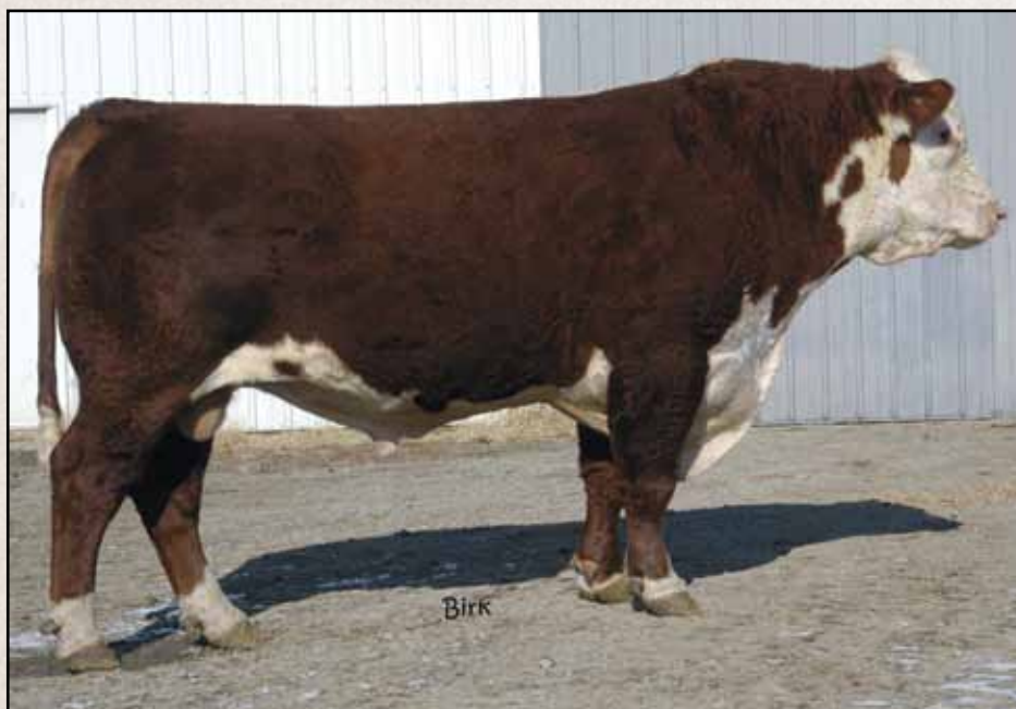
Ref. Sire — GHC Premier 155K

The following heifers are bred to calve this spring. They were synchronized and bred AI. The pasture exposure was to CT GHC Peacemaker 123R who has been a very easy calver for us. This group of bred heifers is very hard to part with.