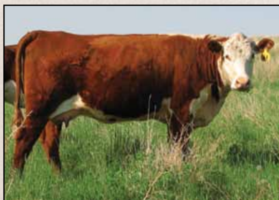
CT Miss Premier 129U — Daughter of 155K Sold in last year's sale to Crittendens in Canada and soon to be a donor cow for them.