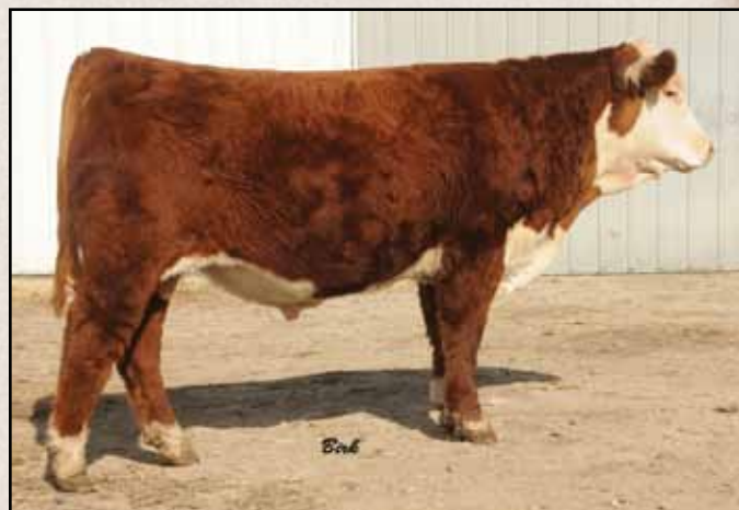
Lot 3 — C&L CT Federal 485T 6Y