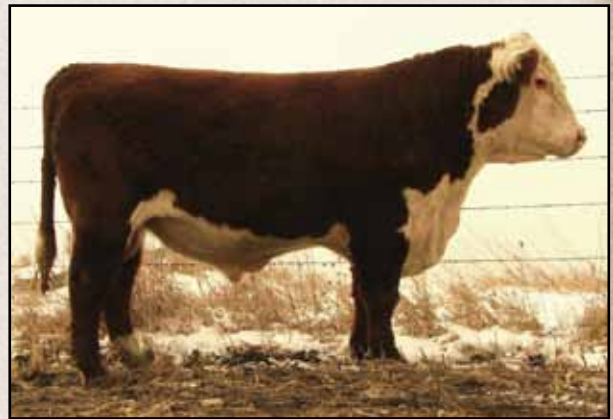
Lot 29 — CT Cardinal 70X