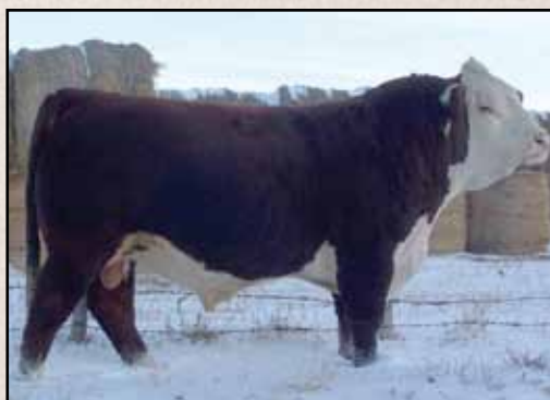
McCoy 55M Absolute 49S — Sire of Lots 49 and 50

P43139193 — Calved: Feb. 17, 2010 — Tattoo: BE 86X MCCOY 3J MATADOR 55M MCCOY 55M ABSOLUTE 49S (DLF,HYF,IEF) P43051126 MCCOY 58G CONNIE 119L HH HUNTER 572P (CHB) CT MISS HUNTER 167T P42902230 CT MISS CHEQUE 976 MOHICAN HUNTER 57H (SOD,CHB) RJ MILK MAID 32J (POD) WALPOLE CHEQUE 2R CT MISS ALPHA 9777