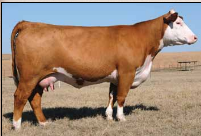
TRM Cowgirl 8066 — Maternal sister to Lot 1