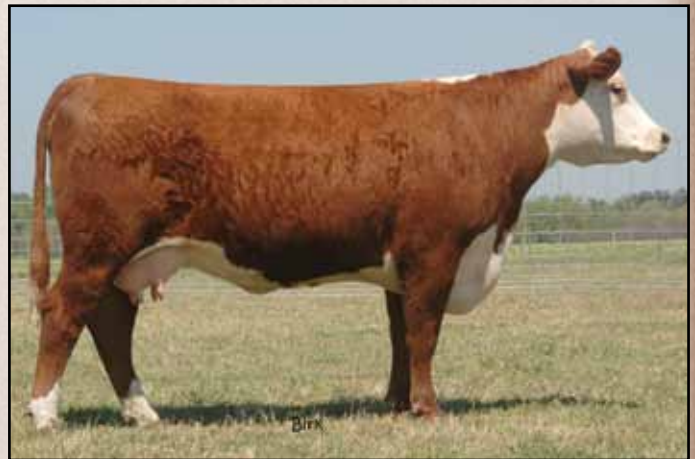
THM Kelly 29F 3043 — Dam of Lots 15 and 16