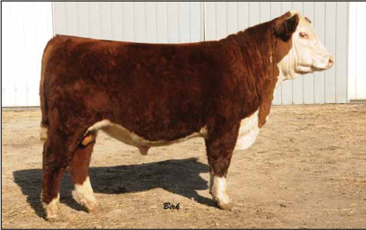
Lot 15 — CT Bookmark 181X ET