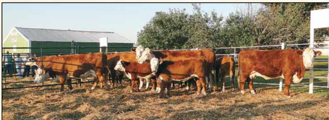
Cattle on display at the 2009 SD Hereford Tour.