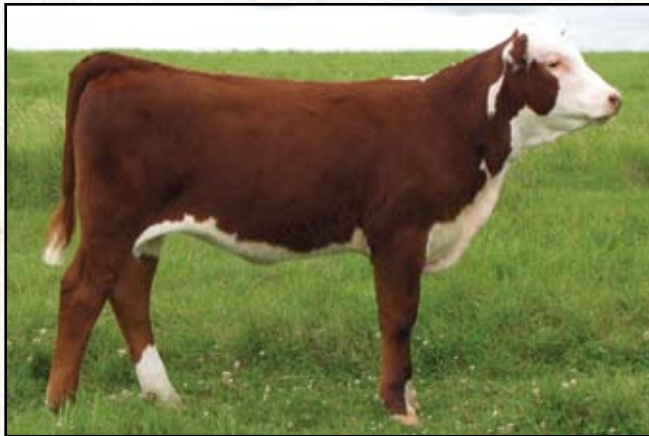
Lot 22 — JDH MS 10S YANKEE 30X ET