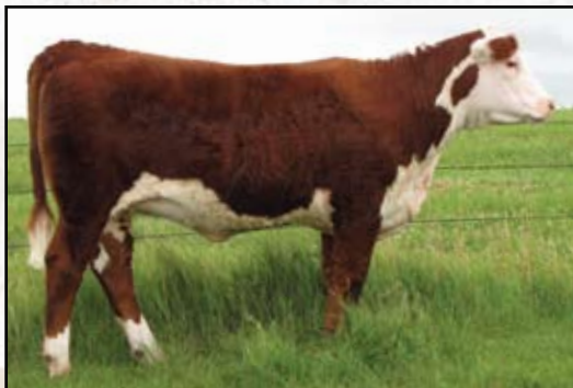
Lot 4 — JDH MS 15T WRANGLER 16W ET