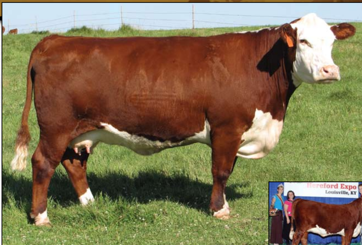
Lot 6 — AH QUEEN BELLE 14R