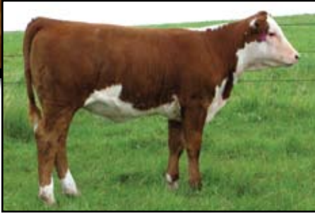
Lot 6B — AH JDH MS 25L WRANGLER 37X ET