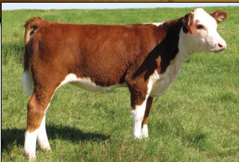
Lot 11 — AH ALL ABOUT ME 1X