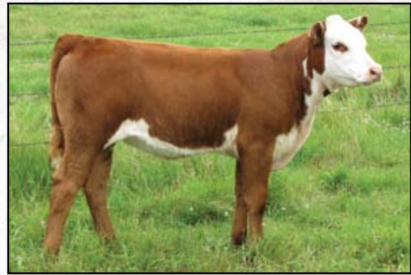
Lot 9 — JDH MS 15T WRANGLER 28X ET