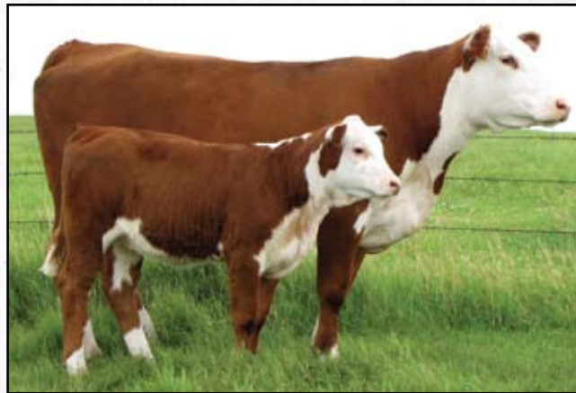
Lot 30 and 30A