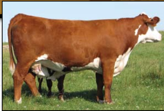
Lot 13 — JDH MS P10L WRANGLER 33T