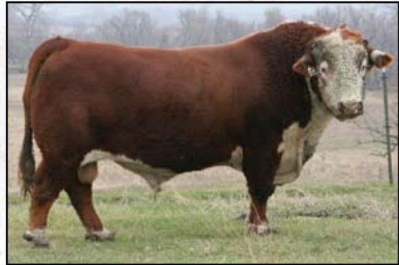
THR THOR 4029