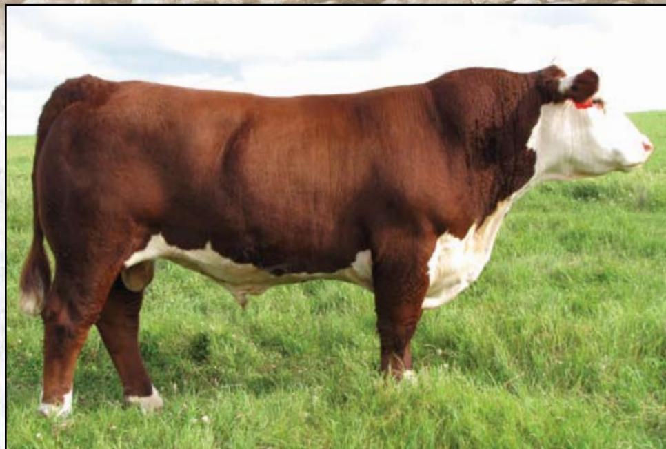
AH JDH CRACKER JACK 26U ET

Delaney Herefords 2071 C.R. 101 Lake Benton, MN 56149