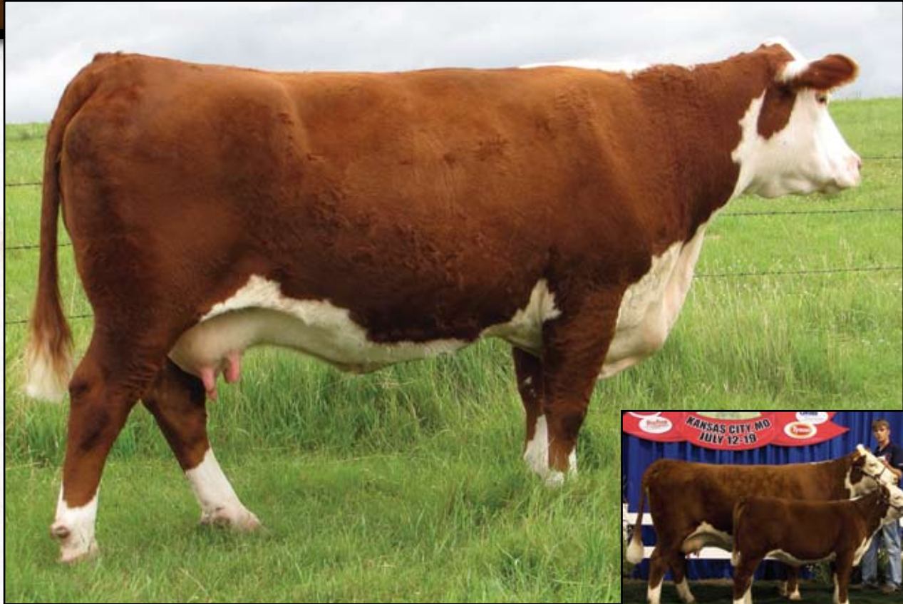
Lot 1 — JDH MS P606 BOOMER 20R