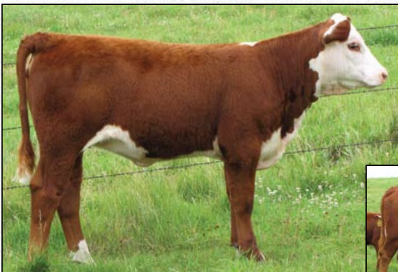
Lot 12 — JDH MS 26U CRACKER JACK 58X