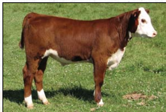
Lot 6A — AH JUST IN TIME 3X