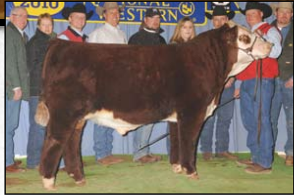
HARVIE TAILOR MADE ET 7W