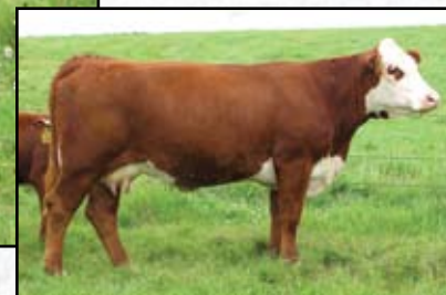
JDH MS 11P BOULDER 39T Dam of lot 12