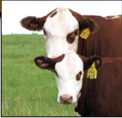
AH MS 10L RRANGLER 75T — Dam of lot 32A Lot 32A — JDH MS 260 CRACKER JACK 61X