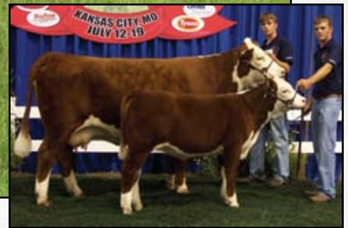
JDH MS P606 BOOMER 20R 2008 JNHE Class Winner