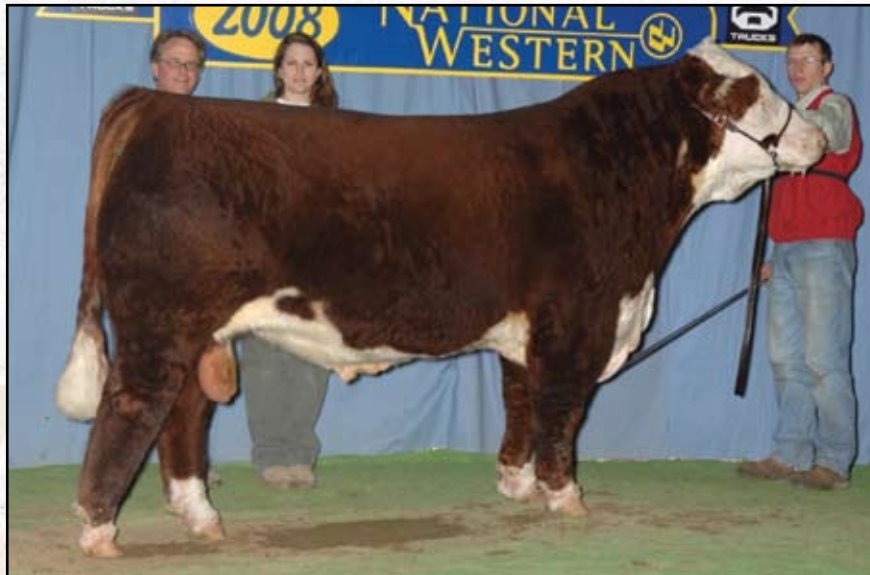
AH YANKEE 10S

A great producing cow and prolific donor, Violet was purchased by Atkins Herefords in the 2004 Mile High Sale in Denver. She consistently produces calves with great performance, volume, muscle and style including class winners at Denver and Ft. Worth and a Reserve Champion Heifer Calf at the American Royal in Kansas City. In Denver in 2009, a son was the lead bull in our Reserve Champion Pen of Three Bulls. In 2010, another son was the lead bull in our Denver Pen of Three bulls and a daughter was the lead heifer in our Pen of Three heifers. In the last three Denver Mile High Night sales, Violet has had three heifer calves sell at an average price of $11,200. Her sons, Yankee, Cracker Jack, The Bus and others are making an impact on our herds and many others. Many of the following lots carry the influence of this great cow. Here is your opportunity to inject the strength of her genetics into your herd!