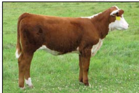
Lot 20 — JDH MS BRIGHT FUTURE 33X ET