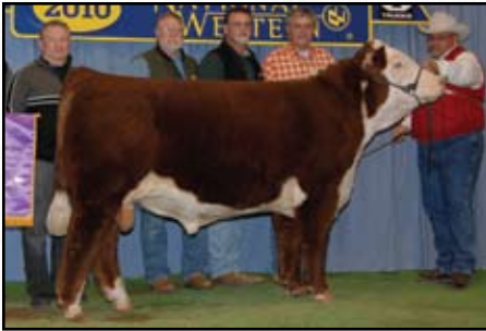
STAR TCF SHOCK & AWE 158W ET Sire of Lot 6C and 6D