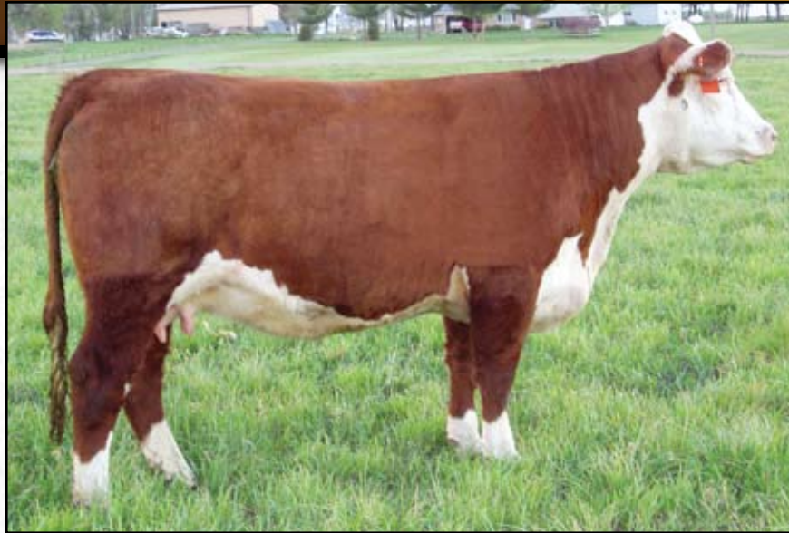
CRR D03 VIOLET 349