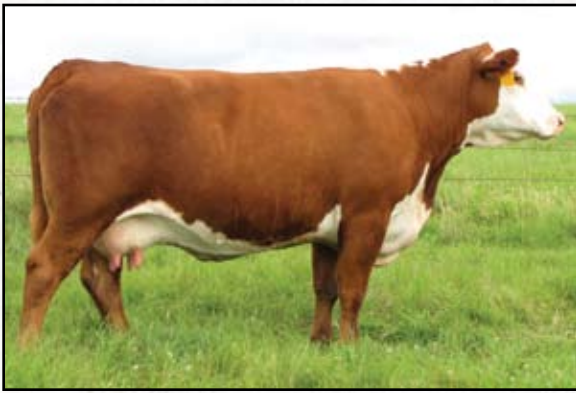
Lot 35 — JDF MS 13N KOOTENAY 39R