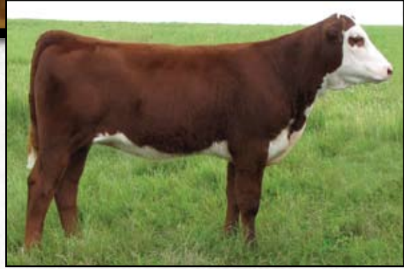
Lot 32A — JDH MS 260 CRACKER JACK 61X