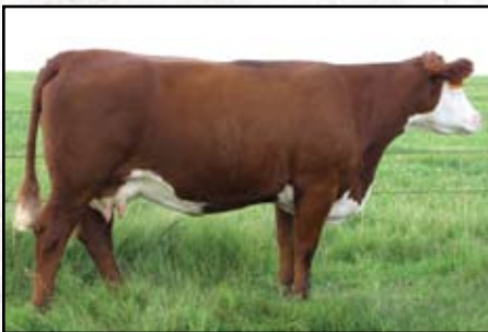
Lot 7 — JDH MS 11P BOULDER 39S