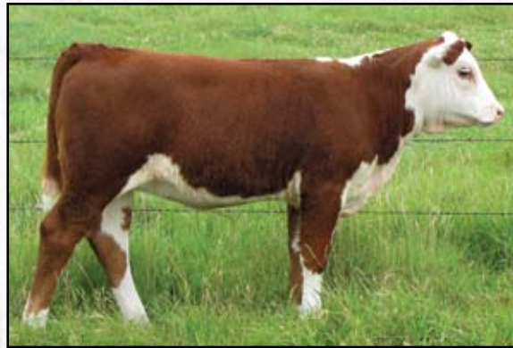
Lot 17A — JDH MS 41U RECRUIT 81X