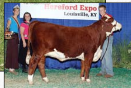
AH QUEEN BELLE 14R 2006 JNHE class winner