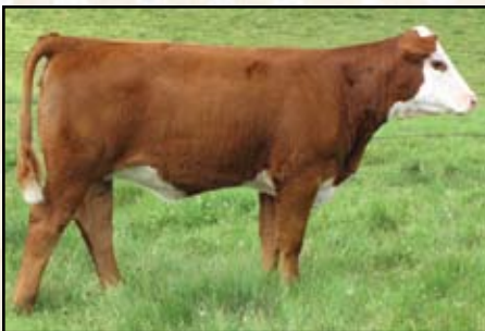
Lot 7A — JDH MS 10S YANKEE 55X