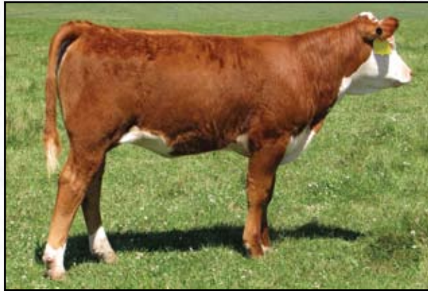
Lot 28A — JDH MS 19D WRANGLER 8T 40X