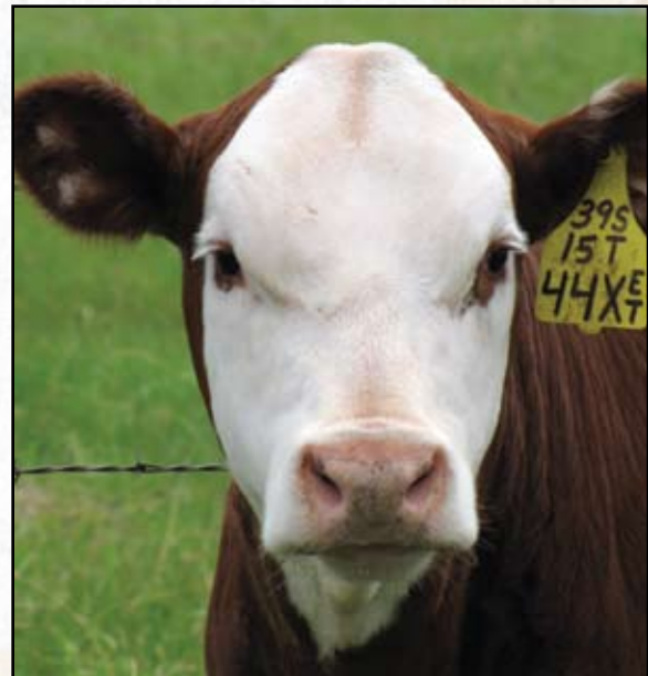
Lot 10 — JDH MS 15T WRANGLER 44X ET