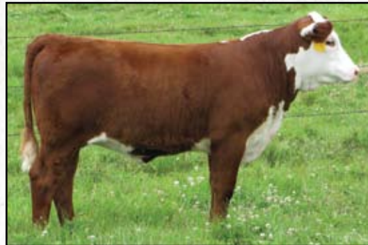
Lot 19 — JDH MS BRIGHT FUTURE 27X ET