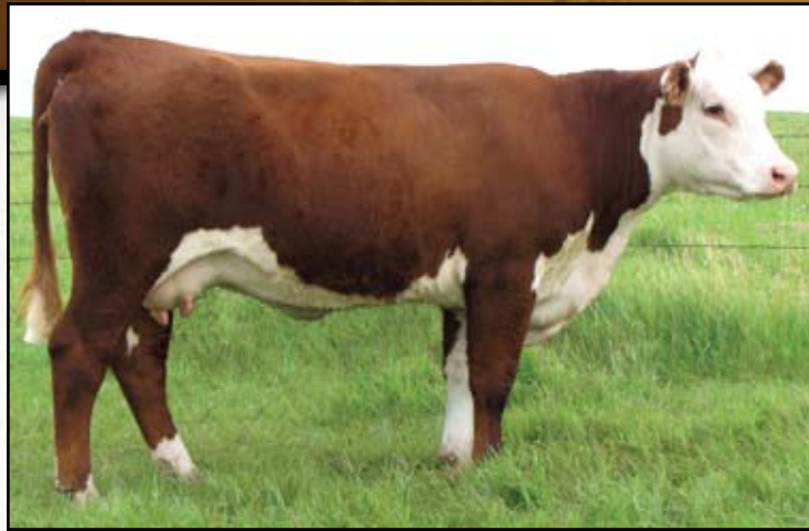
Lot 3 — JDH MS RECRUIT 13U ET