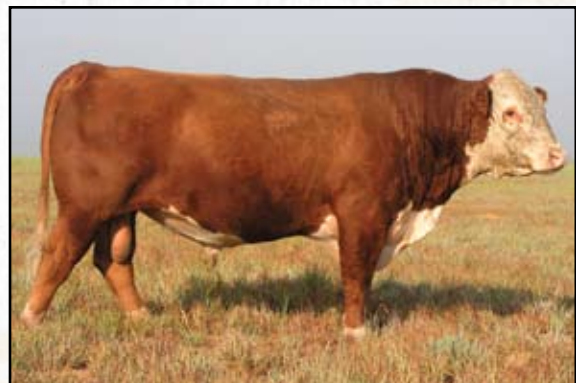
SHF RIB EYE M326 R117