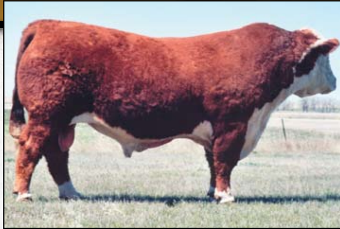
JDH 15 WRANGLER 25L — Sire of JDF AH 25L WRANGLER 15T ET and son of JDH MS LUTE 18J