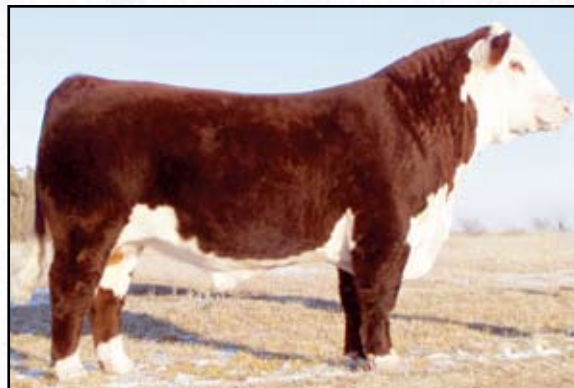
KJ 2403 RECRUIT 966R — Sire of Lots 2 and 3