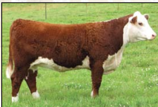
Lot 5 — JDH MS 15T WRANGLER 22W ET