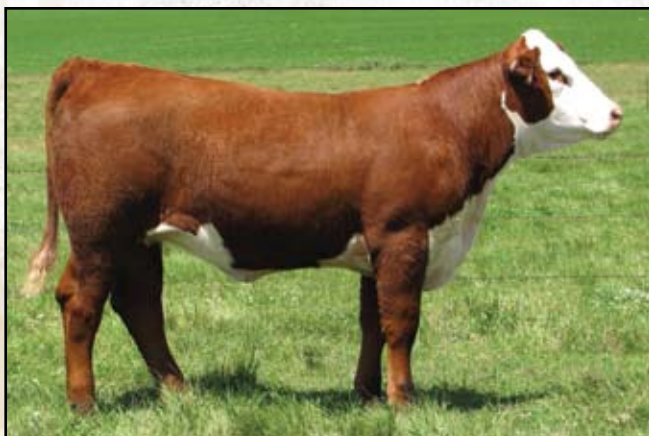
Lot 24 — AH JDH WRANGLER QUEEN 34W ET