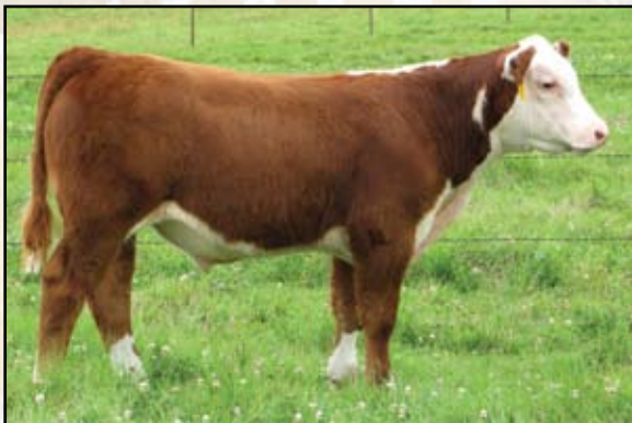
Lot 1A — JDH 26U CRACKER JACK 25X ET