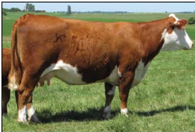
Lot 33 — JDH MS 100M BOULDER 9S