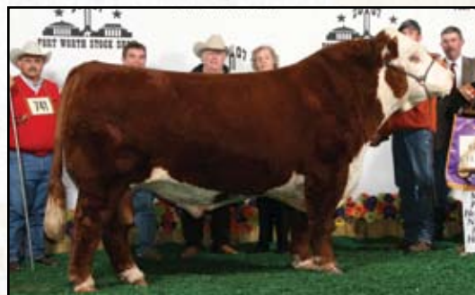
STAR BRIGHT FUTURE 533P ET Sire of Lots 19 and 20