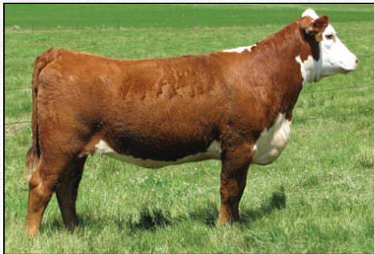
Lot 39 — JDH MS 10S YANKEE 31W