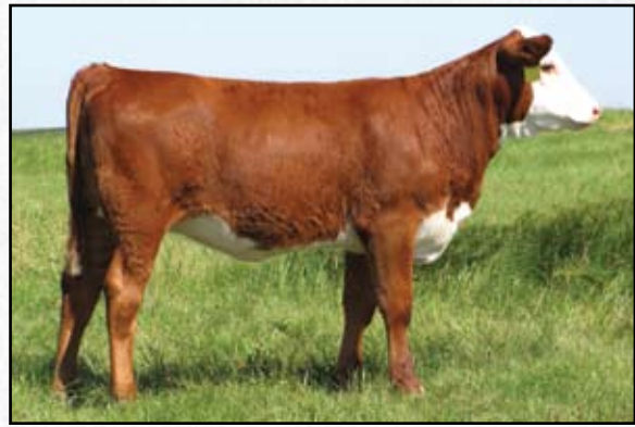
Lot 36A — JDH MS 10S YANKEE 53X