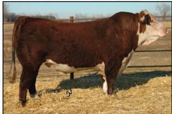
TH 122 71I VICTOR 719T