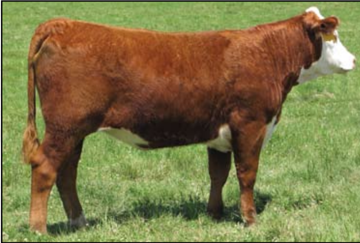
Lot 43 — JDH MS RED FELTON 76W